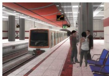
Heading to the metro