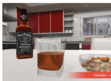
Being alone at home