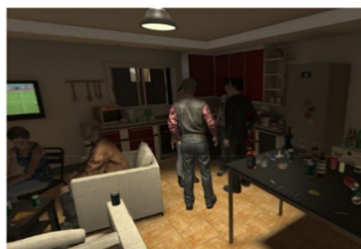
Going to a party