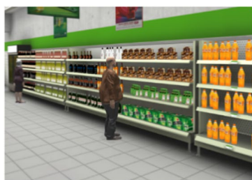
Going to the supermarket