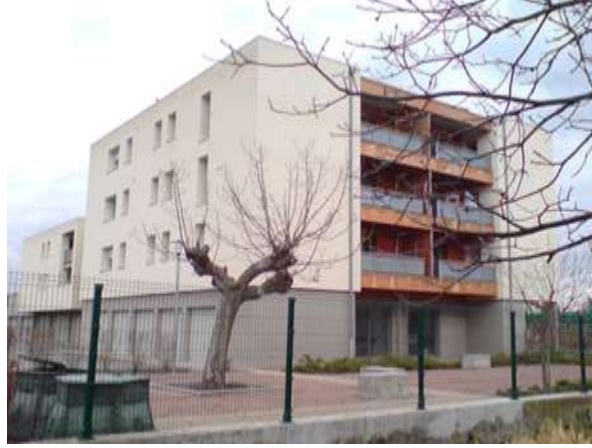
Figure 1 : Exterior view of the base case study

Table 1 presents the thermo-physical characteristics of the building's envelope. The external walls insulation material is Xtherm Itex 32E expanded polystyrene (Anon 2023), with a thermal resistance of R= 3.4 \text{ m}^2\text{K/W} . The roof is constructed with a wooden framework and topped with roman tiles, incorporating cellulose fiber insulation with a thermal conductivity of 0.125 \text{ W/m}\cdot\text{C} . For the windows, insulating double glazing filled with argon (4/16/4) is utilized, of U-value of 1.4 \text{ W/m}^2\cdot\text{C} and a PVC frame.