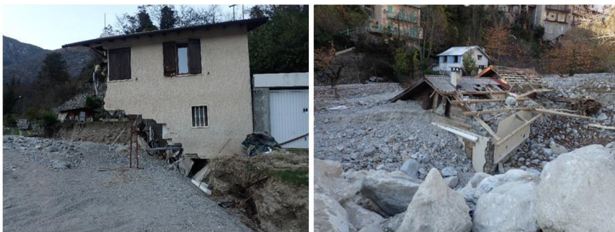
Figure 3 : Post-event photos of the field: (left) St Dalmas de Tende, damage caused by scouring of foundations (Source: ONF-RTM); (right) St Martin Vesubie, damage caused by massive deposition (Source: ONF-RTM).