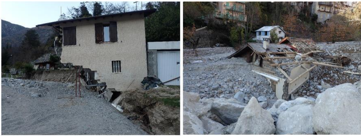
Figure 3 : Post-event photos of the field: (left) St Dalmas de Tende, damage caused by scouring of foundations (Source: ONF-RTM); (right) St Martin Vesubie, damage caused by massive deposition (Source: ONF-RTM).