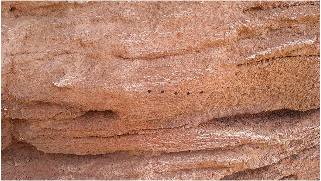
Figure 3: Details of the structures and LIBS laser shots markings reproduced on the Martian setting.