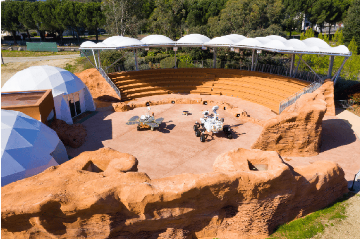
Figure 1: General aerial view of the Mars Yard, with full scale replicas of the Zhurong , Sojourner and Perseverance rovers, before installing a giant outdoor screen above the rocky setting.