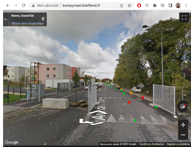
Figure 3: Speedbump interpreted as a road problem (red).