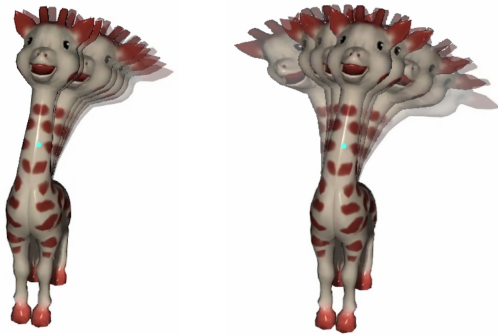
Figure 1: A rigged giraffe neck is rotated toward a vertical position. While the drag deformer of the Velocity Skinning [RTK*21] only models a single delay (left), our method can model long-term oscillation behavior adding dynamic effects (right).

We propose a method to enrich the animation of rigged characters with exaggerated oscillation behavior triggered by a sudden velocity change. Our approach is based on the extension of Velocity Skinning to space-time deformation, where the deformation is computed from a time-filtered version of the angular velocity of the skeleton. The time-filter is easy to parameterize by artists with respect to frequency, magnitude and attenuation while remaining fully compatible with standard rigged character.