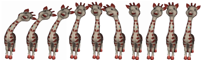
Figure 2: Temporal evolution of our oscillating behavior for the motion depicted in Fig. 1.

On the one hand, physically-based approaches have been extensively studied and can automatically compute exaggerated dynamic effects via fast position based dynamics [WU23] or reduced deformation subspace [ZBLJ20, BZC*23]. Still these methods remain hard to parameterize for artists as the physical parameters have non-linear effect on the result. Furthermore, they cannot reach the