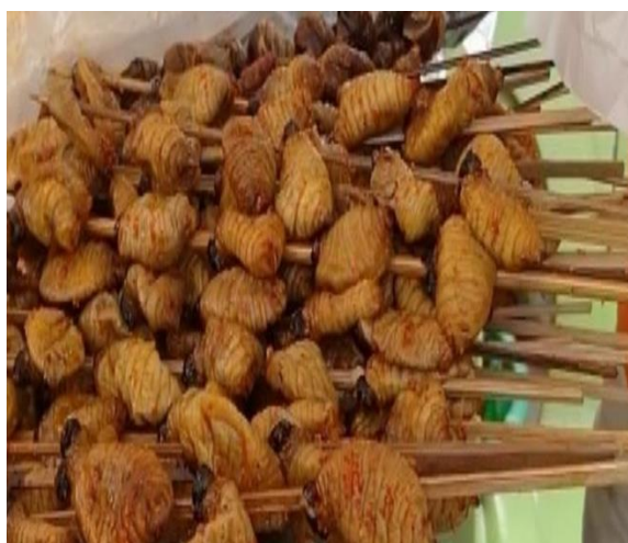
Plate 1. Roasted ready-to-eat edible larvae of Rhynchophorus phoenicis