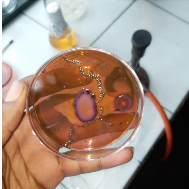
Plate 1. Appearance of greenish metallic sheen Escherichia coli on EMB Agar

Disclaimer/Publisher's Note: The statements, opinions and data contained in all publications are solely those of the individual author(s) and contributor(s) and not of the publisher and/or the editor(s). This publisher and/or the editor(s) disclaim responsibility for any injury to people or property resulting from any ideas, methods, instructions or products referred to in the content.