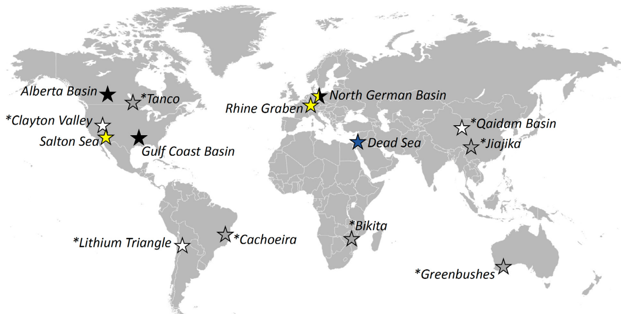
Figure 2. World map showing the locations of emblematic lithium production sites* and advanced projects (except for the Dead Sea), with color code for the main types of lithium resources as indicated in Figure 1. More complete information on lithium resources with or without active exploration/production projects and their precise locations are available from USGS (2024), Munk et al. (2025), Benson et al. (2025), and Brett et al. (2025). For pink lithium, see CAS (2025), showing the locations of lithium-ion battery recycling plants. Background political world map after Wikipedia Commons (2025).

process results in the emission of 3–4 tons of CO 2 equivalent and consumes 25–56 m 3 of freshwater (Kelly et al., 2021; Mas-Fons et al., 2024), not including the water evaporated during solar evaporation (100–300 m 3 ; Mousavinezhad et al., 2024). DLE requires industrial operations for extraction, purification, and conversion that emit the equivalent of 20 tons of CO 2 and consume 20–150 m 3 of water to produce one ton of lithium carbonate equivalent. However, freshwater can be recovered through the processing of Li-rich brines (Baspineiro et al., 2020; Mousavinezhad et al., 2024).