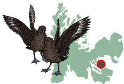
Île Verte n = 11