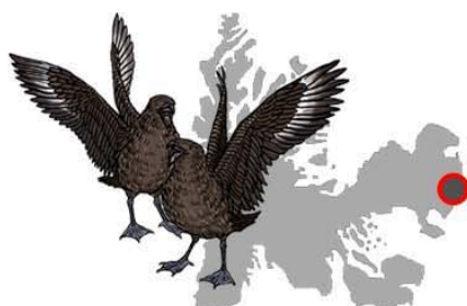
Cape Ratmanoff n = 11