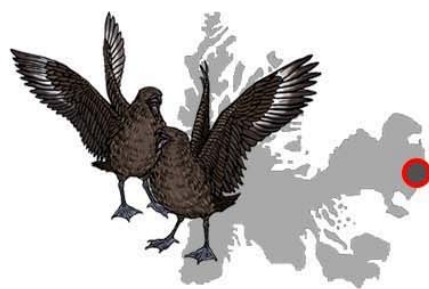
Cape Ratmanoff n = 11