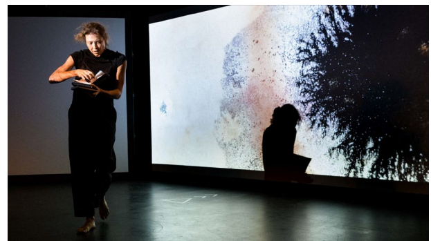
Figure 13: The dancer carries diaries in front of watercolour projections.

A single dancer begins the performance with a contemporary solo dance, setting the stage for the performance. The dancer rearranges the chairs into a cohesive circle, dragging, carrying, and sliding them through careful movements—laying across them, dancing around them. The projections display text and video that abstractly introduce the characters and their challenges punctuated by recordings of the watercolour painting process that created the icons for each character.