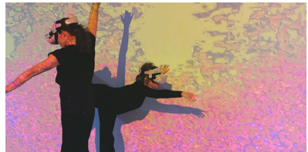
Figure 12: Dancers perform wearing headsets in front of a projection of their view.

In some performances, the dancer begins with a short prelude wearing headsets with the passthrough enabled. This is done to lead the audience to the performance space and attract attention either in open public spaces or in the lobby. For example, at Recto VRso 2023, the prelude began with two dancers performing in front of a large projection outside the exit of the Laval Virtual awards ceremony as seen in Figure 12.