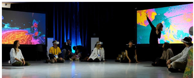
Figure 22: Participants sit in a circle watching the finale. Several remain in VR watching through sound-modulated passthrough visuals.

All participants are then invited to form a circle and sit. The dancer performs a final choreographic message referring to acts of sharing and helping. Some watch in mixed reality while others watch directly. The passthrough visuals continue to respond to the music in the headsets and in the projections as the performance draws to a close.