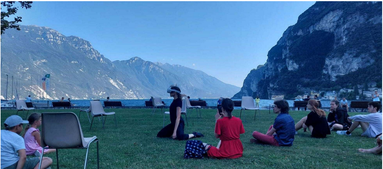
Figure 1: Performance of Eve 3.0 at PAN Festival 2023 in Riva del Garda, Italy. Visit https://compagnievoix.com/en/projects/creation/eve-3 for trailers and more information.

Virtual Reality. Immersive Performance. Interactive Performance. Touch. Dance. 360 Video.