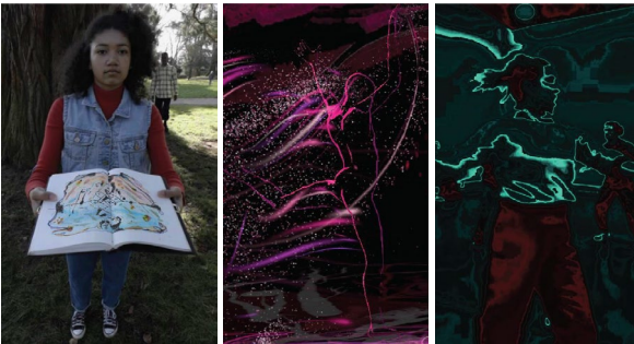
Figure 4: Eve 3.0 progresses from 360° video (left) to motion-captured dances rendered in real-time (centre) ending with responsive passthrough visuals (right).

Observers watch the performance, witnessing the Travellers' and Performers' interaction and the interwoven narratives guided by the dancer. This role experiences all the stories told by Eve from a different perspective. Two projections show what is seen by the Travellers along with abstract visuals.