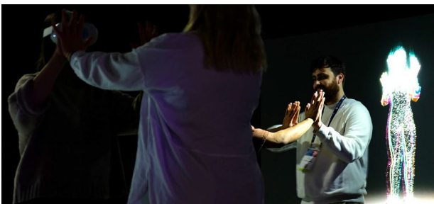
Figure 19: "Travellers" wearing a VR headset dance with "Performer" participants.

As the individual motion-captured dances end, the silhouette walks towards a predefined point and raises their hands. The dancer goes into the crowd to gather six Performer participants bringing the total on stage to twelve. The Performers stand in line with the position of the silhouette with their hands out. As the Travellers wearing VR headsets reach out, they contact the Performers' hands, bringing the silhouette to life through touch. The Traveller wearing the headset follows the silhouette's movements, unknowingly leading the Performer in dance through their hands.