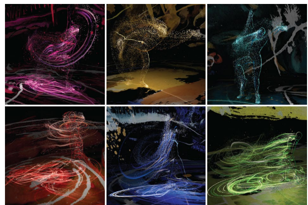
Figure 10: The 6 CG characters each in an environment generated from watercolour imagery. Top-left to bottom right: Fiona, Lohan, Desiree, Amir, Meredith, Jonas.

Visual Effect Design. The characters in the motion-captured segment are generated using Unity 2021's VFX Graph and Shader Graph. They use the character's colour scheme to produce a neon-digital, ethereal particles and outlines to help them stand out in front of the watercolour background. The visual effects evolve over the course of the performance. Initially, they create a dust-like trail that fades over time, accentuating the poses that the dancer moves through. Along with the narrative development, the trails begin to follow the dancer in space, reinforcing expressive movements. These are also projected onto the stage floor, referring to the characters changing over time. They paint a new image as they learn to adapt and face the challenges from their childhood integrating their past and present selves into an evolving painting.