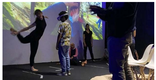
Figure 17: Dancer performing motifs from each character, connecting the virtual and physical performances.

The diaries are the guiding elements to reveal the intimate stories of each character. The main character holds their diary up to the participant in the 360° video revealing an icon. The icon comes to life as particles emerge from it and forms a silhouette in front of the participant. Participants are transported within the diary as the imagery from the icon fades into view surrounding them.