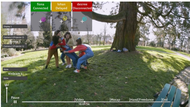
Figure 11: PC Interface. Left: display and webcam controls. Top: network connectivity indicators show participant alignment. Bottom: timeline controls.

Synchronization. Open Sound Control (OSC) is used to synchronize the six headsets, soundtrack, and video projections. A PC-based controller broadcasts its timestamp and clock time on a Local Area Network (LAN). Each VR headset aligns its timeline to the PC and responds with the time received. The round-trip time is used to synchronize the clocks, synchronizing within approximately 10 milliseconds of the PC. The headsets each transmit their position relative to key moments and can be re-calibrated by pressing a button on the PC. The PC controller is used to play 1 or 2 projections and plays the music and some audio. Each character's audio is played locally on the headset allowing for six different stories to be heard simultaneously. An Android phone-based controller can also be used to synchronize and play music only when projections are not needed.