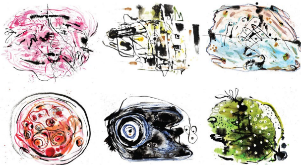
Figure 7: Watercolour icons. From top-left to bottom-right: Fiona, Lohan, Desiree, Amir, Meredith, Jonas.

Immersive Environments from Traditional Media. Watercolour artist Amira-Sade Moodie and graphic designer Kirstin Huber produced six icons representing each character. The paintings were digitally scanned and edited in Photoshop to produce the icons seen in Figure 7. These icons were used directly in each diary as shown in Figure 4. The icons were also used to create the immersive environments for the CG segment. VR participants enter the imagined space of the diary, going from seeing the icon on the page to being surrounded by it. The original painting is shown next to the resulting environment in Figure 8.