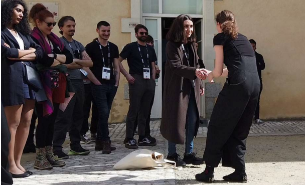
Figure 14: Dancer selecting a participant from the crowd.

The dancer looks for six spectators in the audience to be invited to sit on the chairs and put on the headsets. These six Travellers join in a shared choreography where the dancer moves around them and interacts through touch at specific moments. Touch and performance in front of an audience requires a careful process of consent. Participants are informed of the performance structure and only invited if they express a clear and enthusiastic desire to participate.