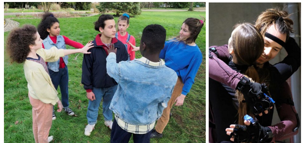
Figure 6: Left: Dancers on the set of 360 filming in Laval, France. Right: Motion capture of the hug interaction.

Hybrid 360° Video. Eve 3.0 integrates a variety of technology to capture and create the alternate reality presented in the VR headset. We used a combination of a 180° stereoscopic camera with a 180° monoscopic rear camera to capture the depth of the characters while focusing attention and eliminating typical 360° stereoscopic artefacts.