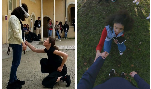
Figure 5: The dancer kneels in sync with the virtual character. Following the music, she touches the immersant's hand in time with the visuals.

Participants' embodiment in the immersive experience is facilitated through physical interaction with the performer. This technique was first used in Eve: dance is an unplaceable place (Bergamo Meneghini, 2019) which Eve 3.0 evolved from. The dancer coordinates her interactions by dancing to the music in a carefully timed choreography as seen in Figure 5. This multi-sensory alignment immerses participants in the reality of the narrative experience (Desnoyers-Stewart et al., 2024).