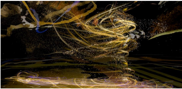
Figure 18: Lohan's silhouette dancing as seen in VR.

This following segment is a 6-degree of freedom real-time CG experience where Travellers see their avatar and can dance with a silhouette of light representing the aura of the character expressing their struggles. A monologue is heard as the motion-captured dance unfolds through the silhouette and particle system as seen in Figure 18. The Travellers dance in response to the silhouette, some following the motion-captured dance, while others move in their own ways. Their own bodies are represented with traces and particles emitted as they move. The Travellers take on more agency, forming part of the generative performance that evolves outside the headset for the Observers.