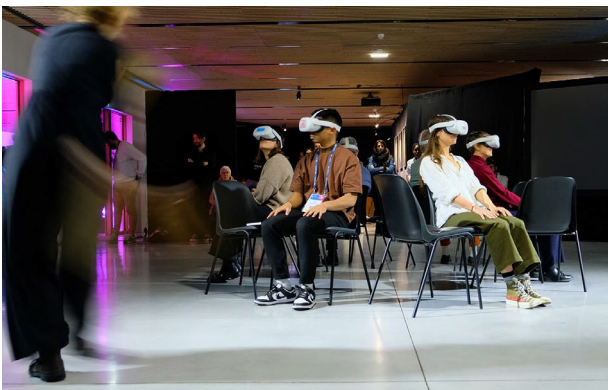
Figure 15: Dancer fans participants as the 360 video appears in front of them.

The immersive portion of the experience begins with a live-action 360° video titled “Dear Diary.” The participants each find the diary of a different character, hearing an excerpt from their character’s childhood as they hold on to the diary. Children playing in front of the participant interact and dance with them. The children tease the main character as they throw around their diary and laugh.