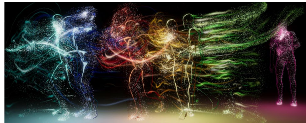
Figure 3: The six characters' internal monologues visual representations. Teal: Desirée, Yellow: Lohan, Magenta: Fiona, Red: Amir, Blue: Meredith, Green: Jonas.

The main character, Eve, is thus in seven places simultaneously: in the physical space shared with the general audience, and in the six virtual stories with the VR participants. Each participant has a different overlapping experience. These narratives are also observed externally, forming a seventh perspective for the audience: a meta-narrative of those characters whose stories overlap fused with the emergent choreography that arises between guided performance and self-expression.