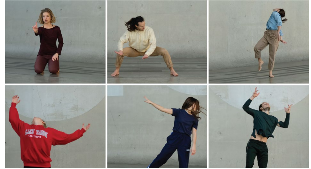
Figure 2: Six dances were motion captured representing six different characters.

a narrative anchor. She ties the dramaturgical line as the experience moves from realistic recordings to abstract interactive images, to mixed reality that gives the participant full control as they return to the real world while still wearing the VR headset.