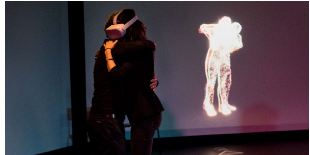
Figure 20: The hug at Tanzahoi 2022. The visuals can be seen in the background.

As the dance ends, the silhouette guides the two participants to hug. The virtual environment fades, and the physical world is revealed through the passthrough cameras. Stepping back from the hug, the Traveller sees the Performer they danced with fade into view in place of the silhouette.