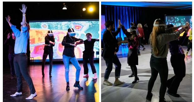
Figure 21: Free dance at Tanzahoi 2022 (left) and Laval Virtual 2023 (right).

The last segment allows the six Travellers to see each other, and their surroundings brought to life through music where they can dance and move together. Their hands continue to produce streamers and particles, encouraging movement. The Travellers wearing the VR headset are then asked to share their headsets with the Performer in front of them. The stage is transformed into a playground for improvised dance as Observers are also invited to join. As seen in Figure 21 this creates a unique ending every time.