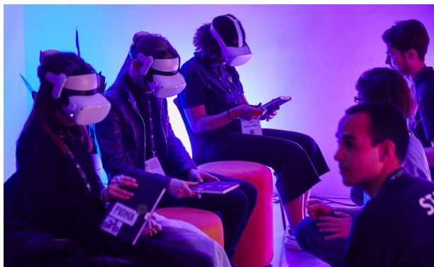
Figure 23: Installation at Recto VRso 2023. Participants pick up a diary seen in VR. facilitators prepare to enact moments of touch.

Eve 3.0 also has an installation mode as seen in Figure 23. In this version, each participant sees the same story so that the moments of touch to be synchronized are in line with the visuals in the projection. This allows volunteers to facilitate the experience for more participants in smaller venues with little training. No dance is performed outside VR, but participants are nonetheless encouraged to perform as they become immersed in the story. Onlookers are also invited to participate by standing in as Performers when possible.