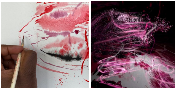
Figure 8: Watercolour painting and resulting scene. Watercolour image ©2021 Amira-Sade Moodie.

To transform watercolour paintings into immersive spaces required a series of transformations applied to each icon as seen in Figure 9. The icon was rounded to create the shape of the virtual stage and inverted to better suit the dark aesthetics of the virtual experience. The original colour scheme was reproduced by rotating the inverted hues 180°. The image was then recoloured to suit the aesthetics of the virtual space. For example, colour was added to Meredith and Jonas which had substantial areas of white that would have been distracting. To create the overhead environment the image is converted from polar to equirectangular coordinates. Finally, those equirectangular images are separated into layers based on the colours. Those layers are then overlaid onto different size skyboxes, creating a sense of depth through parallax.