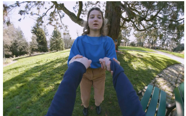
Figure 16: The participant sees a character help them out of their chair at the exact same moment in the video.

The dancer interacts with each participant one after another in a round. This produces a layered dance where the audience can vicariously experience the immersive performance through these reinforced moments of touch. Despite being simple actions, their rapid repetition combined with additional motifs demonstrates the incredible skill and timing of the dancer, deeply engaging the entire audience. Between these key moments, the dancer performs elements of the choreography that are seen inside the headset as shown in Figure 17. Projections show two characters’ point of view in the 360° video allowing the audience to understand its connection to the physical performance.