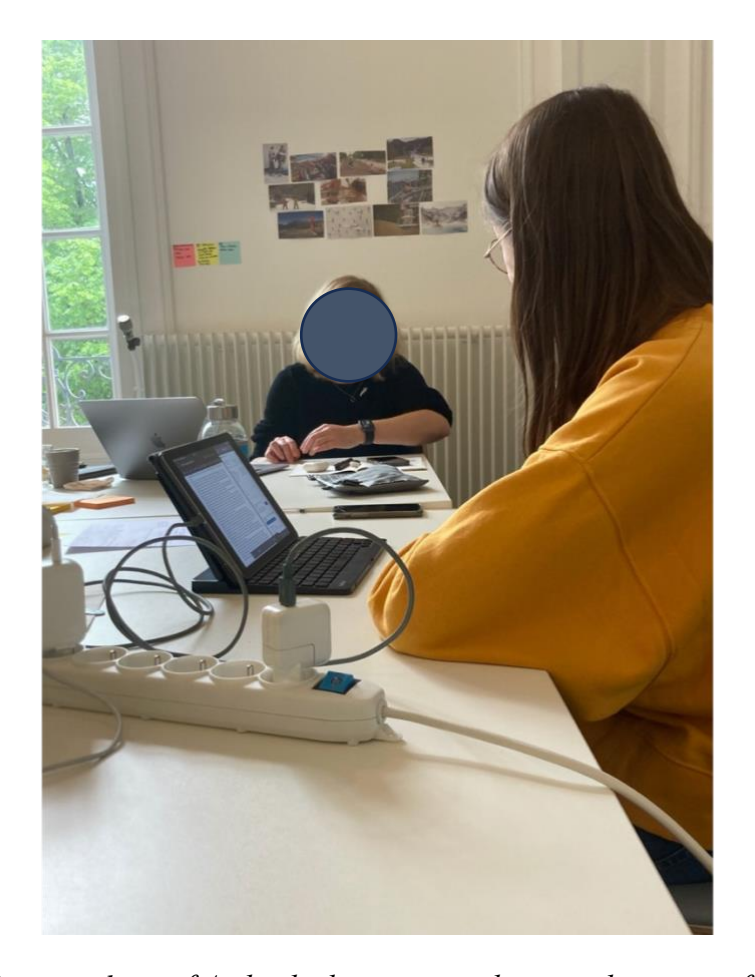
Image 3 – Two members of Ambushed group are chatting about one of their series' characters, in 'generative crea-co-presence'