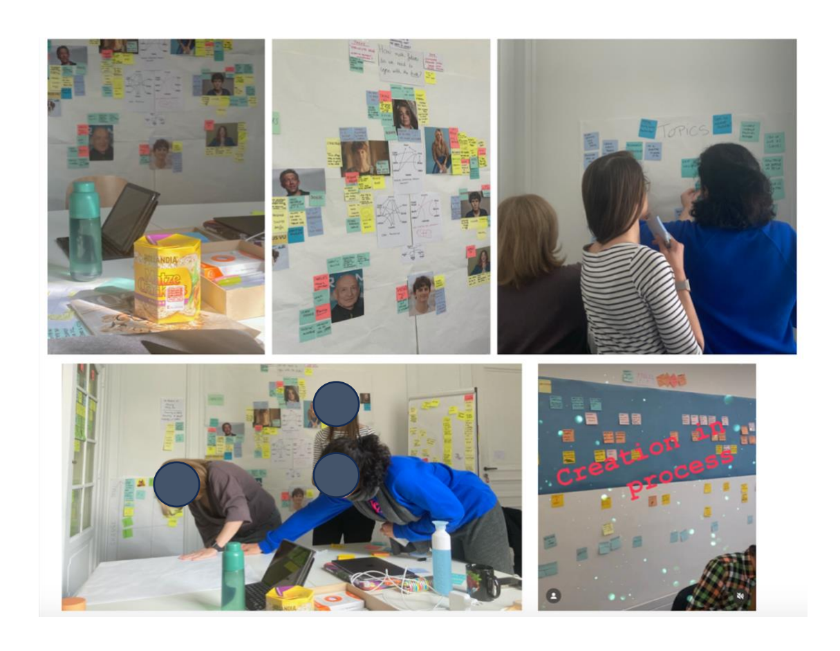
Image 1 – Photo montage based on one of the writers' room in the Eureka Series screenwriting programme