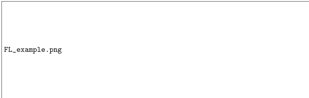
Figure 1: An example of history with 13 states s_0, \dots, s_{12} for the FL problem on which a B-HXP is computed for the win predicate. The agent is symbolized by a red dot, the dark blue cells are holes and the destination cell is marked by a star. Actions identified as important fare highlighted by a green frame.

answers the question: “Which actions were important to ensure that d was achieved, given the agent’s policy \pi ?”. This paper follows this paradigm of explanation of a history with respect to a predicate, by proposing a new way of defining the important actions of a history, called Backward-HXP (B-HXP). In particular, B-HXP was investigated because of the limits of (forward) HXP in explaining long histories due to the \#W[1] -hardness of HXP [1].