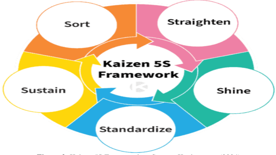
Figure 2 : Kaizen 5S Framework

As shown in figure 2, the kaizen 5S framework are sort, straighten, shine, standardize, and sustain.