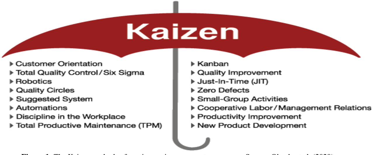
Figure 1: The Kaizen methods of continuous improvement