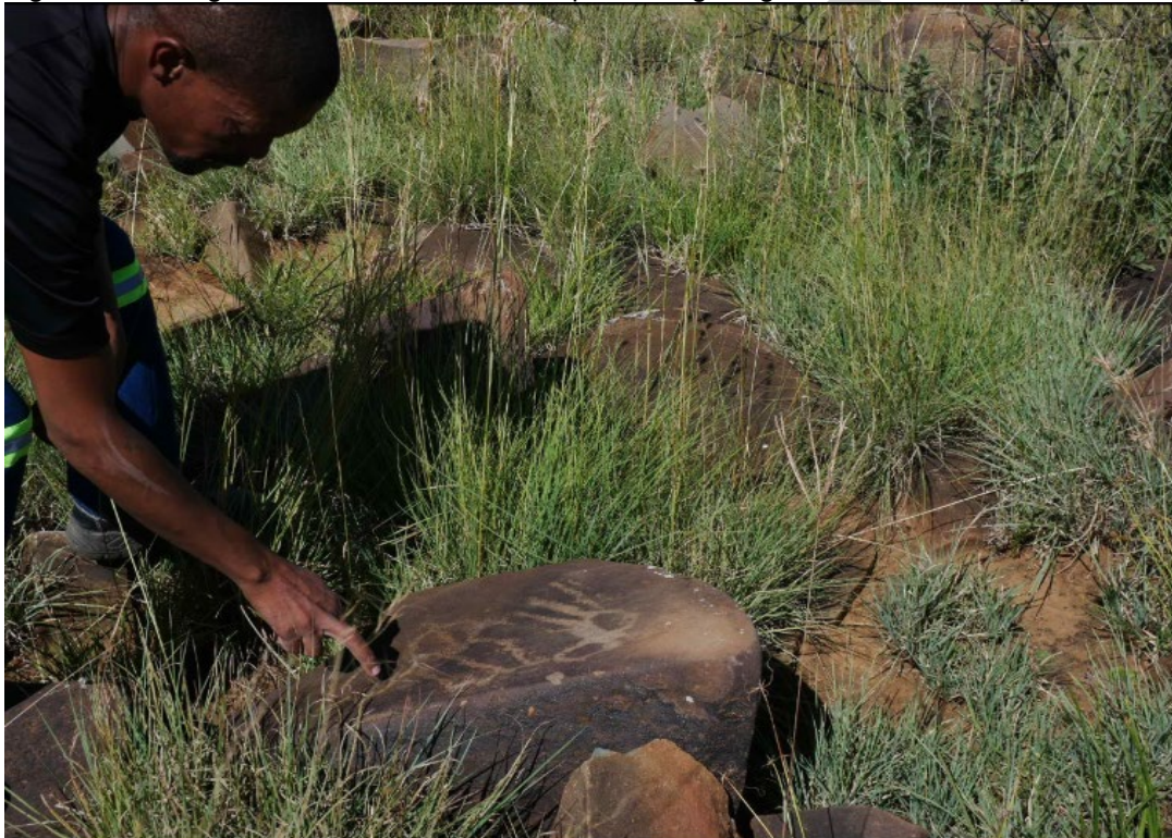
Figure 2 : A guide at Wildebeest Kuil presenting engraved rocks. 7 April, 2022. H.Quemin.

In a short space of time, the Wildebeest Kuil Rock Art Centre turned out to be much less popular than the estimates of visitor numbers on which its construction was based, and the initial expectations had to be reconsidered. The various managers "projected viability [of the Centre] with about 3,000 or 4,000 visitors a year" (interview B. Smith, April 2022). In the early months "Wildebeest Kuil soon achieved a measure of success but, over a decade on, successes have been tempered by shortcomings and low visitor numbers" (Morris, 2014:189). Despite the disappointment of the early years and disillusionment with the hoped-for opportunities, several recruitment sessions (2002-2003 and 2007-2008) were held in the community to train members for permanent positions. Yet, many of them "proved unreliable,