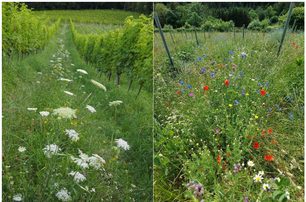
Figure 2: Flowering mixtures in vineyards in Styria/Austria.

c) adapt management strategies in order to enhance biodiversity of natural vegetation and foster herbs and legumes. A possible strategy is to avoid mowing in the middle of the row. This can easily be achieved by corresponding technical solutions (mulcher without blades in the middle or rolling).