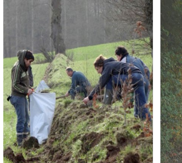
Hedgerow plantation through participatory field work

Another example of innovative uses of hedgerows is currently being under exploitation and implementation in the EIP project in Slovenia. The project "Hedgerows as a support for biodiversity, preservation of the traditional and disappearing cultural pattern of the Slovenian countryside and provision of ecosystem services" is facing challenges in improving and multiplying ecosystem services in agriculture lands through implementation on new knowledge, and a bottom-up approach in bringing fresh ideas from individual farmers to broader community. An innovative idea was also how to increase visibility and production potential of hedgerows in growing truffles, if environmental conditions are suitable.