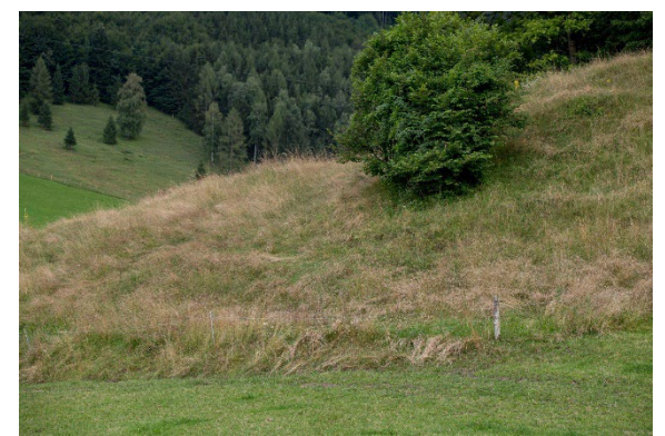
Figure 3: Small extensive managed grasslands in Alpine regions.

This results in several and scattered biodiversity hotspots (Spiegelberger et al. 2006) around the whole farm delivering a big bundle of ecosystem services and in turn with fairly little loss of economic profitability for the farm.