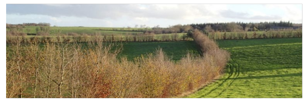
Restoration of hedgerow networks, through the plantation of several hedges.

Figure 1. Agroforestry hedgerows introduced by the "Terres et Bocage association" in Brittany, Western France.