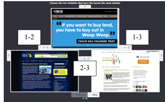
Figure 1. Test User Interface. "1-2", "1-3" and "2-3" enable participant to select most similar layouts.

other triplets. Every 5 evaluations, participants were asked to explain the reasons why they made their choice.