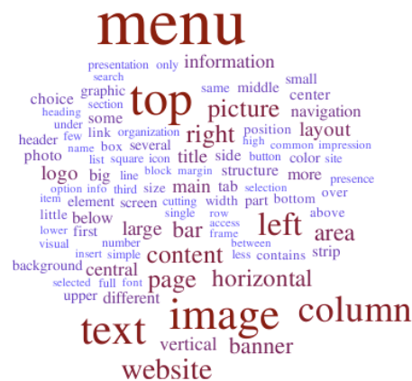
Figure 3. Word cloud generated from participants justifications of their choices.

We observed inconsistencies in participant answers when they were confronted twice to the same triplet but permuted differently. This was very common, 152 of the 164 users (~93%) made at least one inconsistency. On a total of 1102 triplets, 630 were tested for inconsistency with at least one user. This resulted in 341 triplets exhibiting at least one inconsistency (~54%). With respect to the 693 triplets having at least 7 evaluations, 465 were tested for inconsistency. This resulted in 253 triplets exhibiting at least one inconsistency (~54%). This may indicate that participants did change their mind along the test but more probably participants were not really sure about their choice. Indeed, among the 143 triplets having a high consensus and tested for consistency, only 53 were tested inconsistent (~37%) compared to ~54% for all the triplets tested at least 7 times.