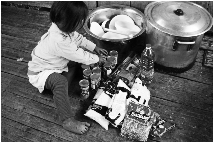
3.2 A Maijuna girl playing with school meal ingredients.

In villages, local leaders, family farmers, and caregivers have complained both formally and informally about the quality of the food from national producers. 37 Some parents complained about allergies their children had when exposed to some products, usually canned food, and about low-quality food with a lot of fat and outdated expiration labels. In 2018, the Interethnic Association for the Development of the Peruvian Jungle (AIDSESP) published the Indigenous Women of the Amazon Agenda to