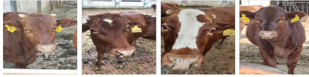
Fig. 1. The cattle face are diversified

The individual cattle breeds we identified are mainly Qinchuan cattle and dairy cows. The body of Qinchuan cattle is yellow and red, so it is challenging to identify the cattle from its body. However, Qinchuan cattle have more facial features compared with the body, including hair color, pattern, face shape, and other characteristics, as shown in Fig. 1. Therefore we choose to construct the individual recognition dataset of cattle face features and study the individual recognition based on cattle face features.