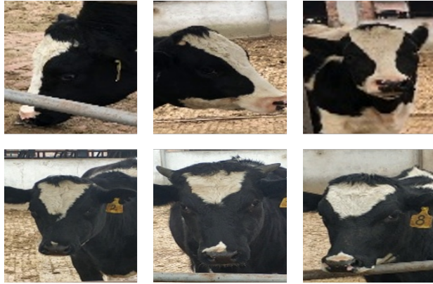
Fig. 2. Large intra-class differences and small inter-class differences in the dataset

We visit cattle farms several times to collect data in different weather conditions and at different periods. Abundant cattle front or side face images under different backgrounds were taken to ensure a more comprehensive background of images in the dataset and a more diverse angle of cattle face.