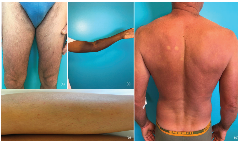
Fig. 2. (A) Confluent diffuse macular eruption with "white islands in a red sea"; (B) purpura of the leg; (C) hematoma after blood test in a patient with a thrombocytopenia; (D) diffuse erythematous rash with finger marks.

In descriptive analyses, means and standard deviations were used for categorical variables; medians, interquartile ranges, and ranges were used for quantitative variables. In bivariate analyses, a \chi^2 test or Fisher's exact test was used for categorical variables; Student's t -test or a non-parametric Mann-Whitney test was used for quantitative variables. In multivariate analyses, a backward stepwise procedure was used to perform a binary binomial logistic regression, including variables with p < 0.20 in bivariate analyses. Adjusted odds ratios (OR) and their 95% confidence intervals (95%CI) were derived from the regression coefficients. All tests were two-tailed and the significance level was set at 0.05. SPSS software (IBM SPSS 23.0; IBM Corp, Armonk, NY, USA) was used for statistical analysis.