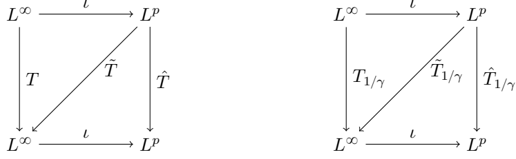
FIGURE 2. Operators related to T in the SIS model (T, \gamma, \varphi) .

Proof. Since L^p is reflexive, see [21, Corollary IV.8.2], we get by [21, Corollary VI.4.3] that T and \iota are weakly compact. By [2, Theorem 5.85], as the space L^\infty is an AM-space, it satisfies the Dunford-Pettis property, thus, by [2, Theorem 5.87], the operator \iota T on L^p is then compact. \square