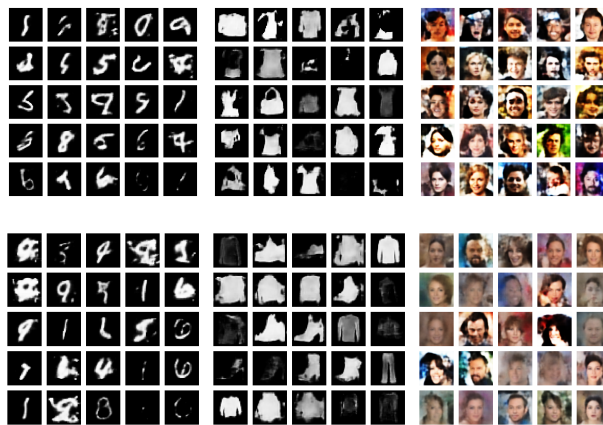
Figure 3: Generated images from DPSWflow-r (upper row) and DPSWgen (lower row) for MNIST, Fashion-MNIST, and Celeba with DP: \varepsilon = 10 .