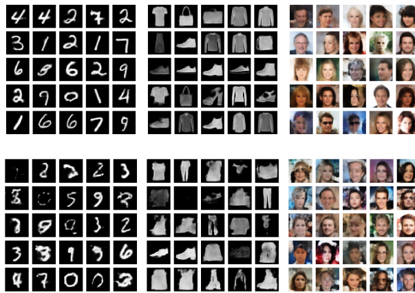
Figure 2: Generated images from DPSWflow-r (upper row) and DPSWgen (lower row) for MNIST, Fashion-MNIST, and Celeba with no DP: \varepsilon = \infty .