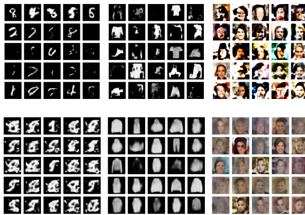
Figure 4: Generated images from DPSWflow-r (upper row) and DPSWgen (lower row) for MNIST, Fashion-MNIST, and Celeba with DP: \varepsilon = 5 .