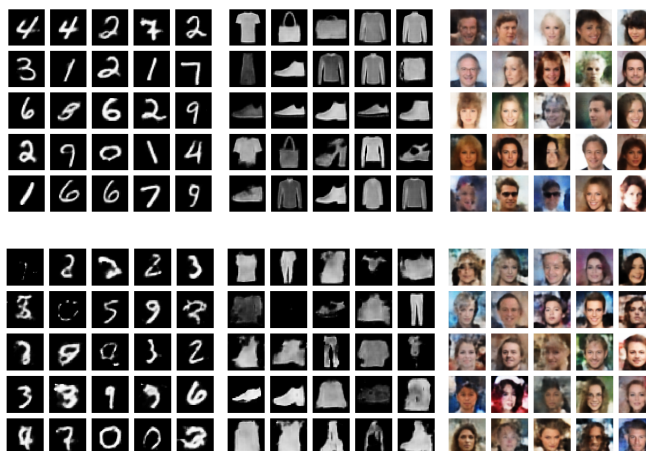
Figure 2: Generated images from DPSWflow-r (upper row) and DPSWgen (lower row) for MNIST, Fashion-MNIST, and Celeba with no DP: \epsilon = \infty .