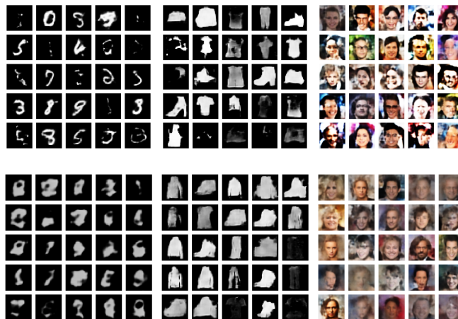
Figure 3: Generated images from DPSWflow-r (upper row) and DPSWgen (lower row) for MNIST, Fashion-MNIST, and Celeba with DP: \epsilon = 10 .

viability, we believe that our method forms a promising basis for future work in the area of private generative modeling.