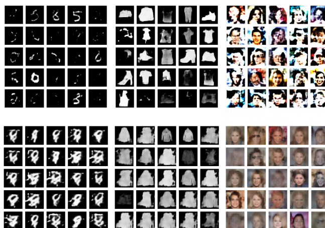
Figure 4: Generated images from DPSWflow-r (upper row) and DPSWgen (lower row) for MNIST, Fashion-MNIST, and Celeba with DP: \varepsilon = 5 .

Luigi Ambrosio. Gradient flows in metric spaces and in the spaces of probability measures, and applications to fokker-planck equations with respect to log-concave measures. Bollettino dell'Unione Matematica Italiana , 1(1):223–240, 2 2008. URL http://eudml.org/doc/290477 .