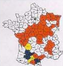
Downy mildew repartition in France during the year 1999.