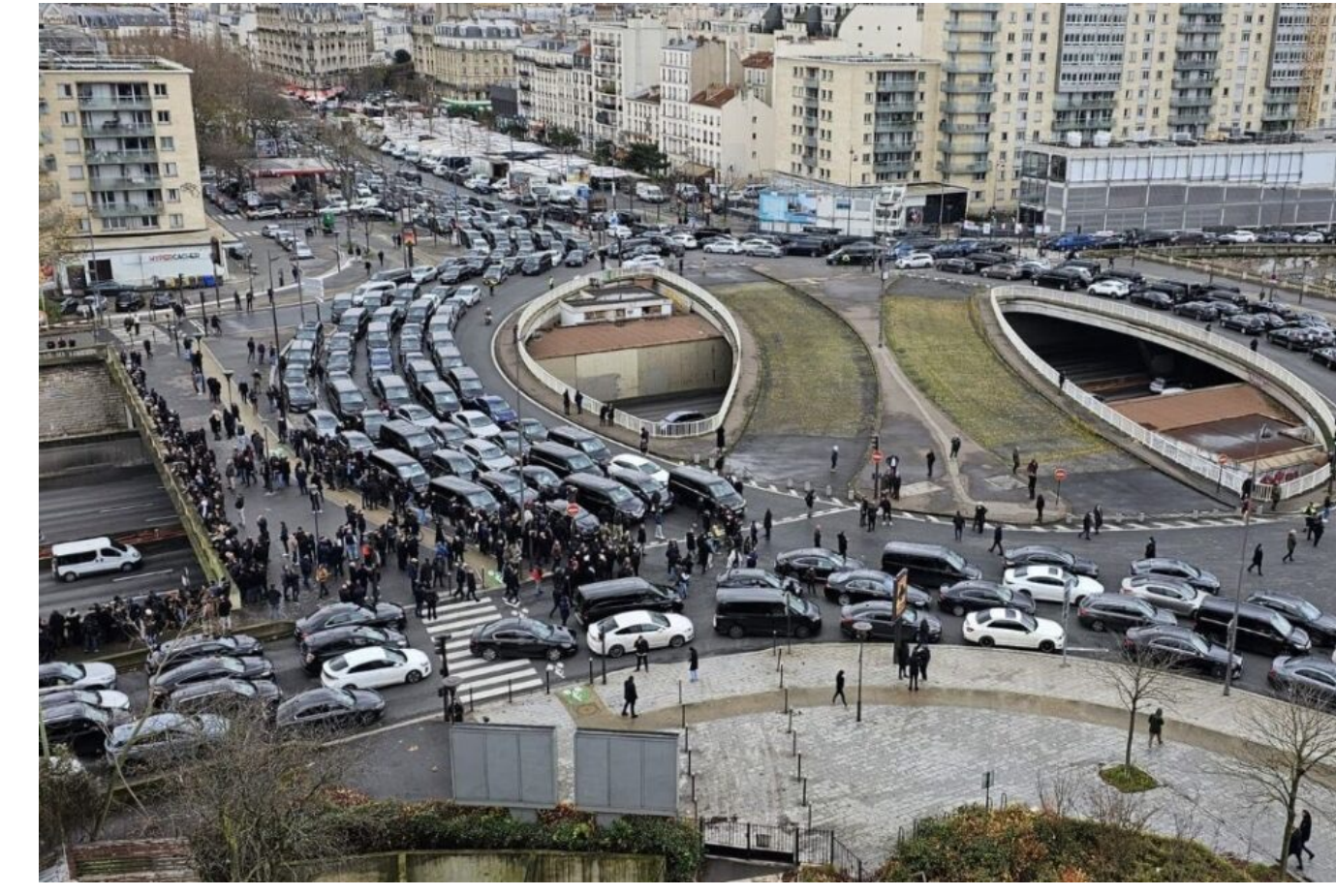
Protests of platform drivers in Paris