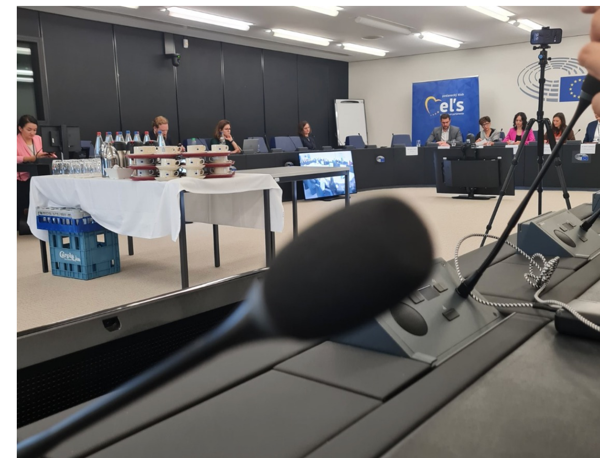
"Citizen lobbying" by a union in the European Parliament in Strasbourg