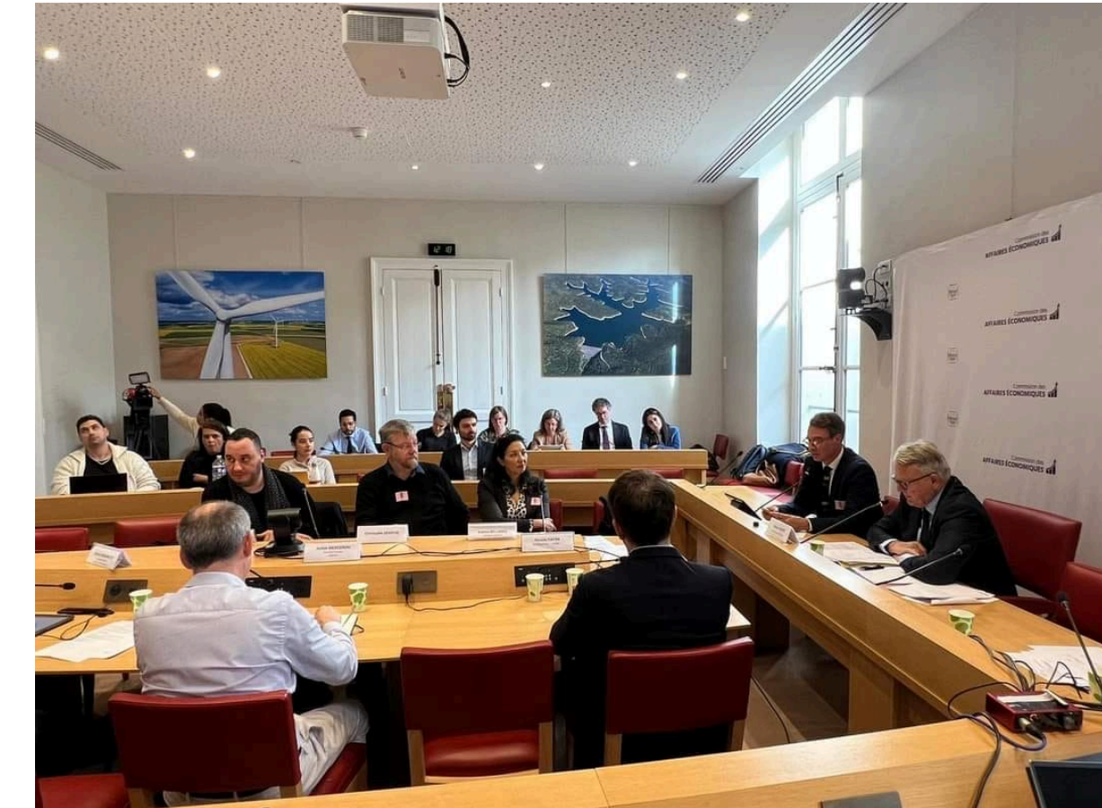
Meeting of politicians and unions to work on proposed laws