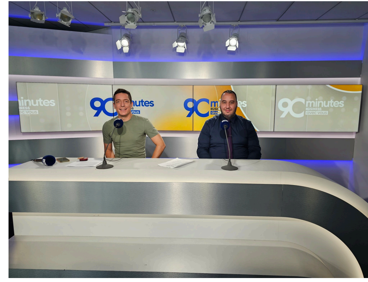
Media interviews with driver representatives

It contributes to worsen occupational health of drivers.