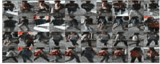
FIG. 3. Individual image generation using CUHK03 dataset.

the final output of randomly selected images generated by the model. Figure 3 illustrates the soft attention mechanism obtained after the VAE process and the influence of the latent space on generating data using the CUHK03 dataset. By