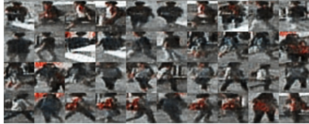
FIG. 3. Individual image generation using CUHK03 dataset.

the final output of randomly selected images generated by the model. Figure 3 illustrates the soft attention mechanism obtained after the VAE process and the influence of the latent space on generating data using the CUHK03 dataset. By