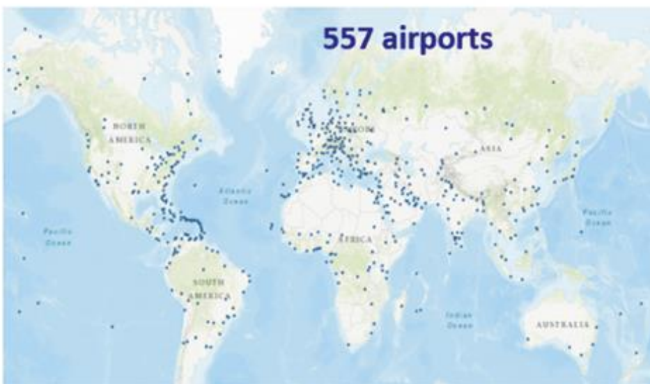
Figure 1 (b) The airports in the large global component of the unweighted network are distributed all over the world