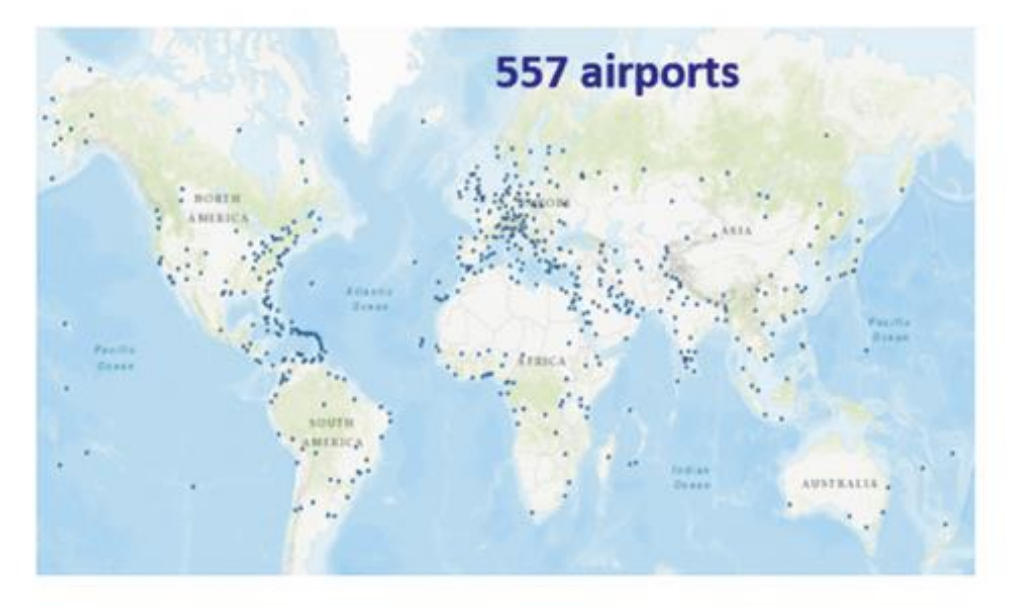
Figure 1 (b) The airports in the large global component of the unweighted network are distributed all over the world