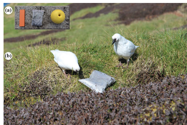
Fig. 1 The objects and setup used for assessing novelty responses in two subspecies of black-faced sheathbills ( Chionis minor ). a The three novel objects used as stimuli. From left to right: orange wood plank, black plastic bag and yellow buoy, b Example of a trial performed by a breeding pair (ssp. crozetensis , Crozet group) with the black plastic bag as the novel stimulus

When both individuals of the focal breeding pair were simultaneously present on their territory, the experimenter triggered the camera, slowly approached the breeding pair, placed the novel object in front of and at about 1 m distance from the birds, and retreated at least 10 m. Only the breeding partner that first approached the novel objects was included in the analyses (see below). Three trials in total