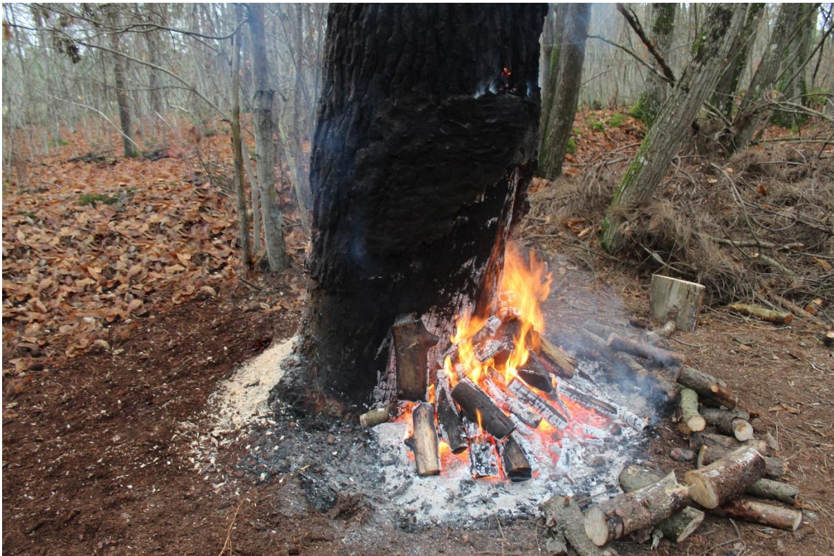
<caption>Figure 2: a. Grub felling of an oak tree 80 cm in diameter at Plouezoc'h (Finistère, France). b. Fire tree felling a maritime pine of 87 cm in diameter at Mézeray (Sarthe, France).