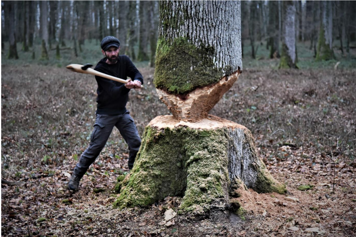
<caption>Figure 3: Felling above the rootstock of an oak tree with 87 cm in diameter in ‘Forêt de Bourse’ (Orne, France).

Recent experimental felling of oak and Scots pine trees with large cross-sections (> 50 cm) conducted by Koruc clearly demonstrates a division between very small millimetric chips at the base of the tree and much larger ones scattered around. These larger chips are sometimes projected several metres away, depending on factors such as the weight of the tool, its power, and the angle of impact. (Arnold 2003, 44). The felling chips exhibit characteristic morphologies that differ from those obtained during the later stages of pirogue manufacture (Poissonnier et al. , 2023). Such preserved data is unthinkable in an archaeological context. They can, however, be used to identify logboat-building sites, which are still poorly known but are mentioned on rare occasions (Leroy et al. 2023).