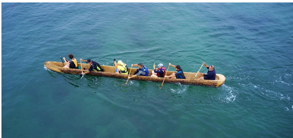
<caption>Figure 4: Sailing in Landéda (29) aboard the 9-meter-long oak pirogue. The crew size can be decreased to five paddlers.