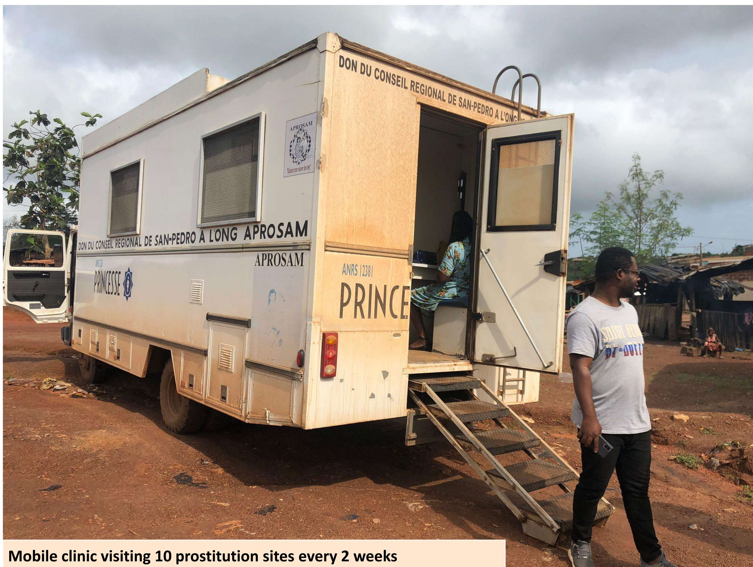
Mobile clinic visiting 10 prostitution sites every 2 weeks