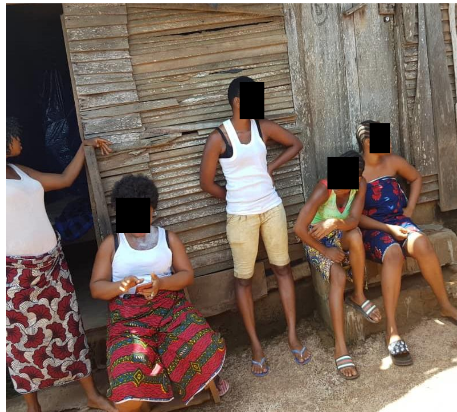
Sex work site