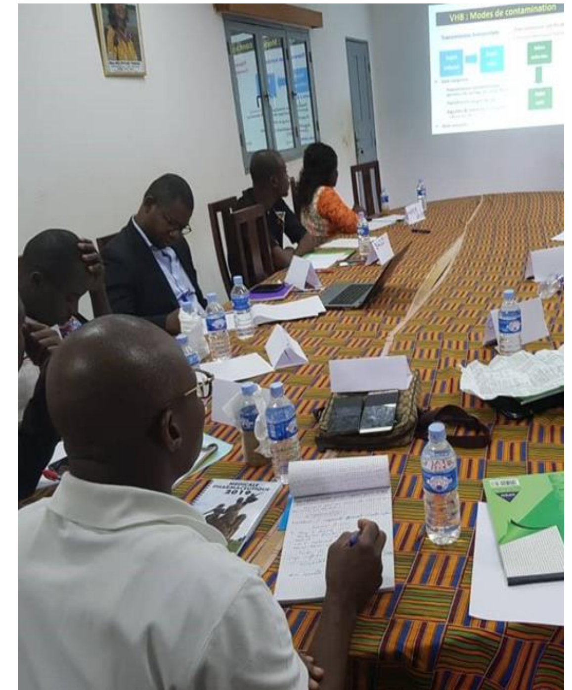
Capacity building for the project team

The availability of biological tests was perceived as a real added value that helped to build a relationship of trust with patients.