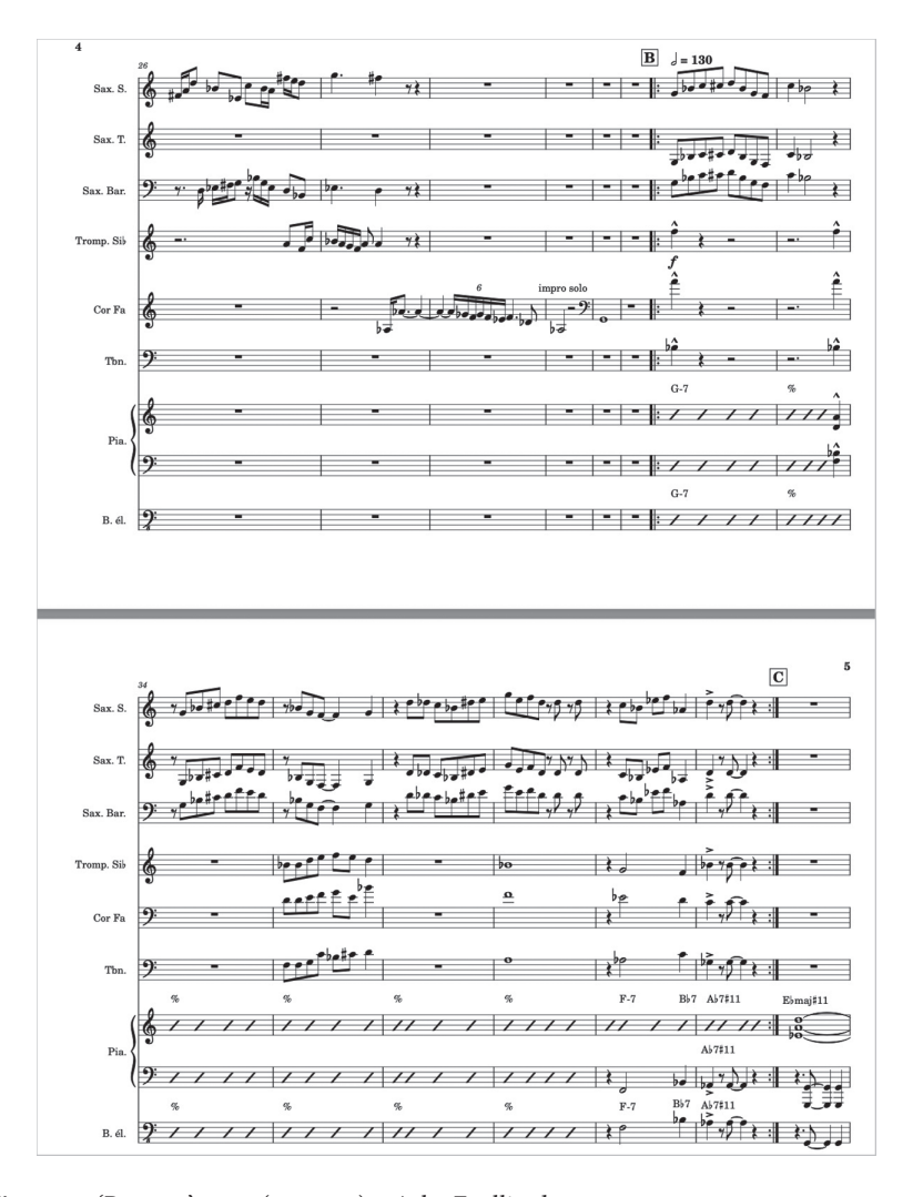
Figure 7. 'Patatras' score (excerpts) – Arlet Feulliard