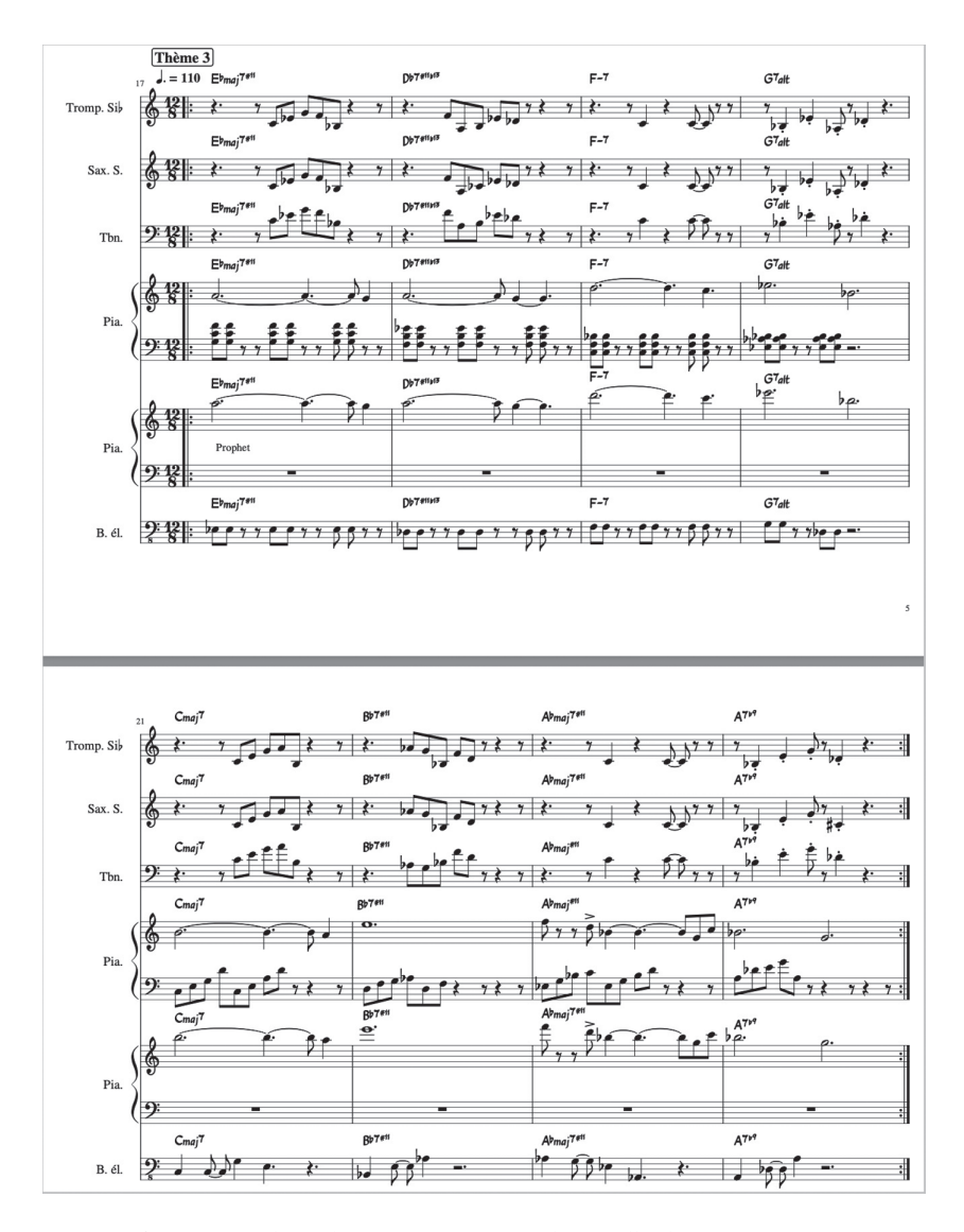
Figure 6. '5 Minutes Chrono' score (extracts) – Arlet Feuillard