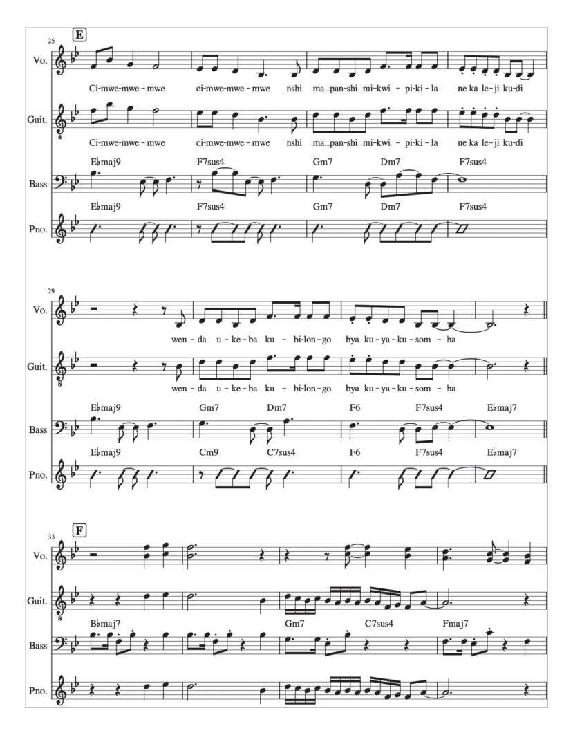
Figure 2. 'Cimemwe mwe' Score (extract) – Monika Kabasele

Greece, Africa, jazz). This can be regarded as one of the constraints induced by the framework of the evaluation, in which Monika felt partly obliged to present many aspects of her musical personality in a reduced time. Above all, it is a manifestation of the eclecticism and discontinuity that characterize fusion processes in a post-structuralist perspective.