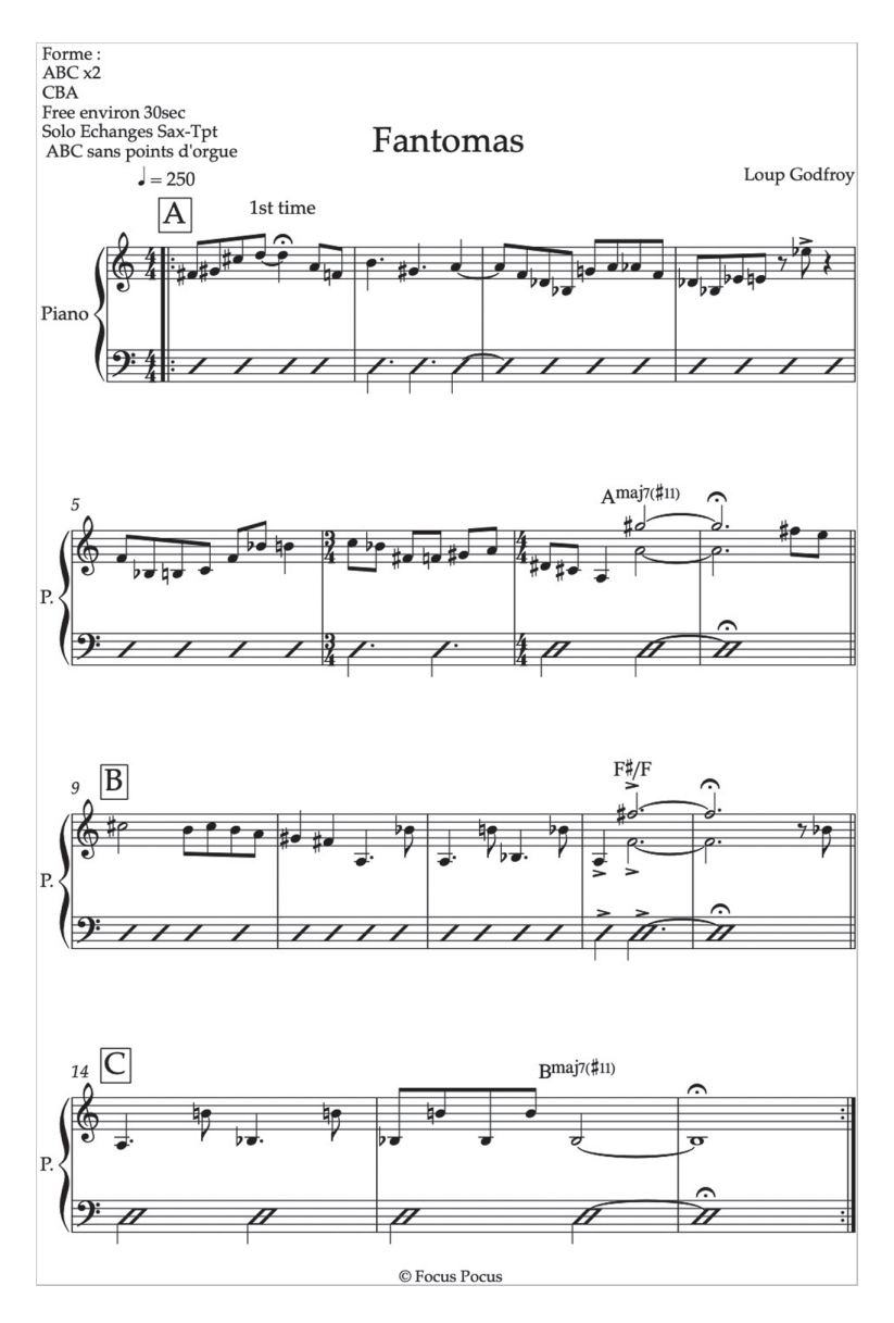
Figure 10. 'Fantomas' lead sheet – Loup Godfroy