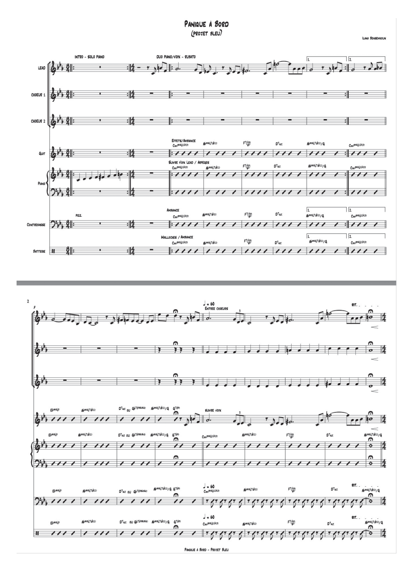
Figure 4. 'Panic on Board' score (introduction) – Ilana Bensemhoun