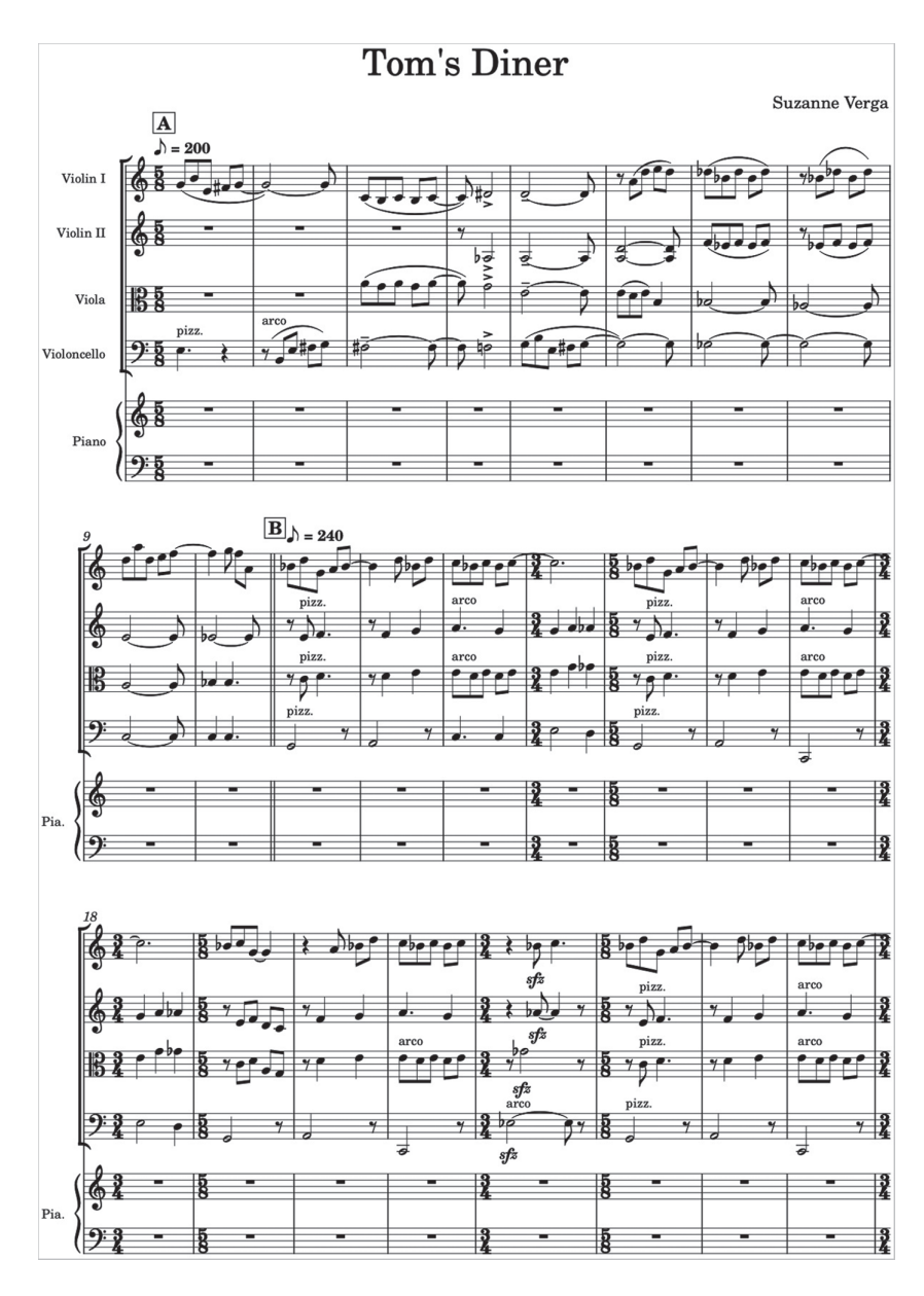
Figure 9. 'Tom's Diner' score (extracts) – Lisa Murcia