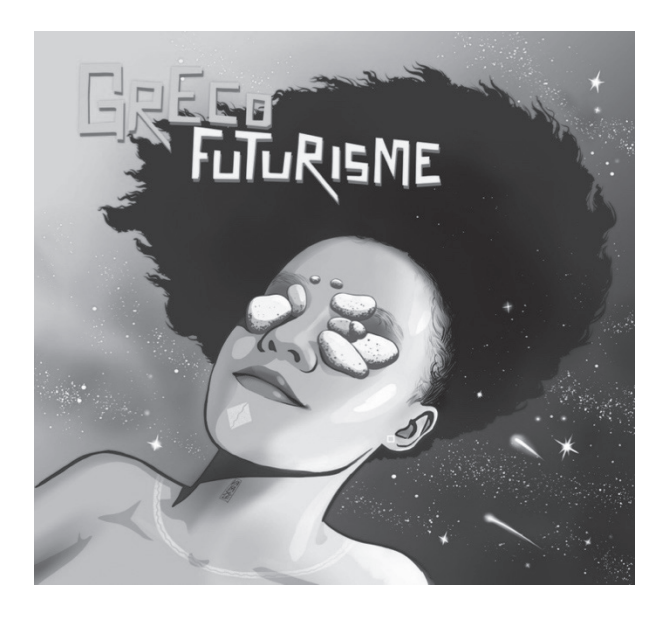
Figure 1. Visual Grecofuturism

AQ: Please provide intext citation for Figure 1 to 9 and 11.