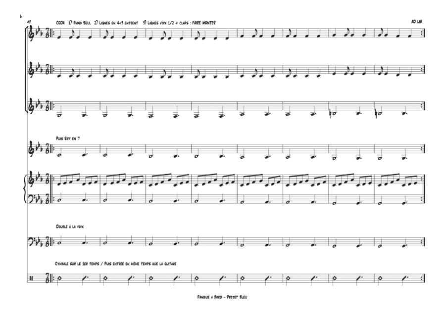
Figure 5. 'Panique à bord' score (coda) – Ilana Bensemhoun