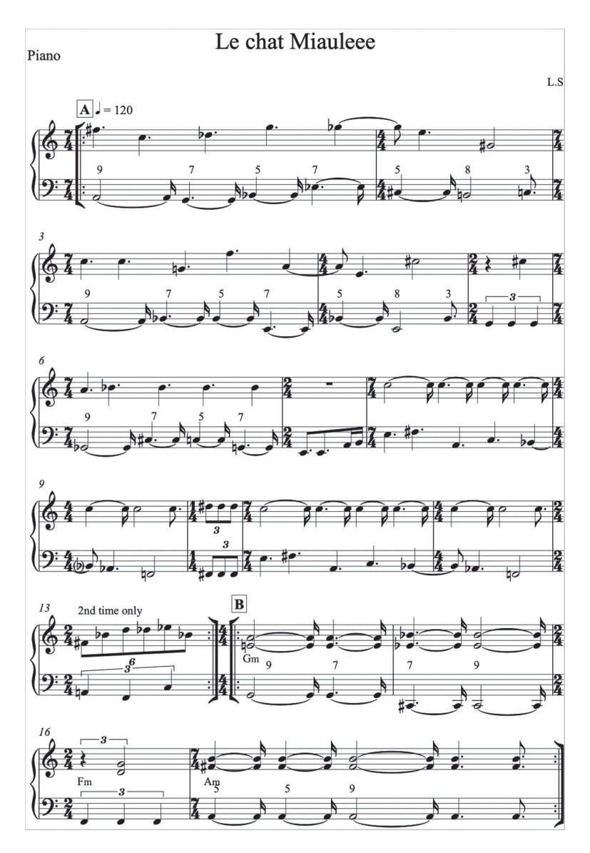
Figure 11. 'The Meowing Cat' lead sheet – Liam Szymonik