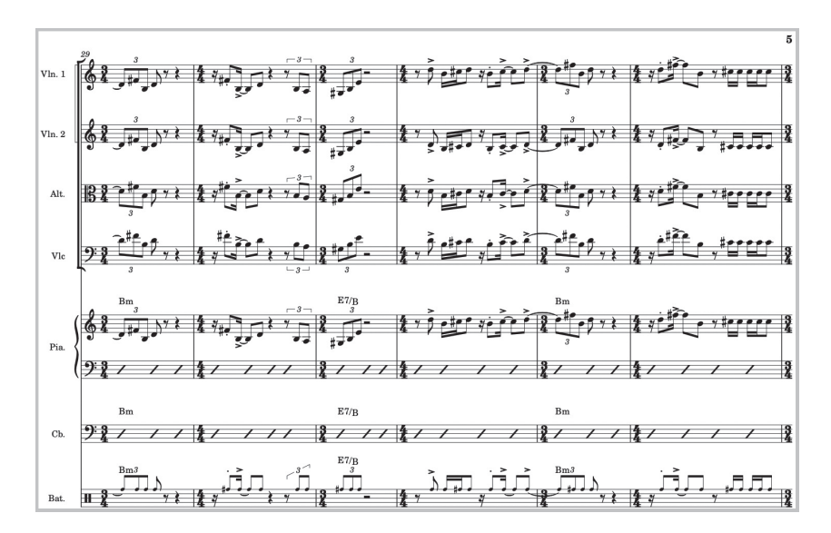
Figure 8. 'Nana' score (extract) - Lisa Murcia

The rhythmic dimension is present in the 5/8 meter, interspersed with breathing in three-beat measures. The drums, which are not indicated in the score, enter at the B mark, which shows the privileged status of these instruments. The contrapuntal technique highlights all the quartet members, with a notable sharing of the theme between the violin and the cello in the introduction. The alternation between the pizzicato and the bowing allows for the creation of several sound levels. The harmonic dimension is also developed during the introduction with voicings in fourths and displacements of minor chords (B-, F-, Eb-). There is a successful fusion of a pop piece, the writing techniques of learnt music, a modal jazz harmonic language, and a groove on an asymmetrical metric. Among its multiple dimensions, this project brings us back to the 'French Opera hypothesis' suggested by Lawrence Gushee.