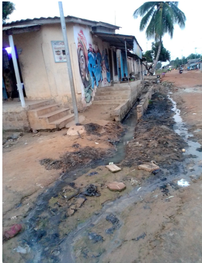
Figure 6. Wastewater on the road to Adétikopé town hall (field photo, CEESPOD, December 2022).