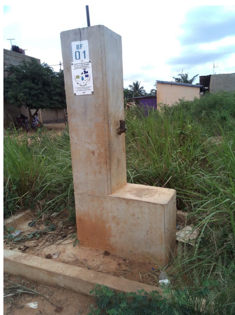
Figure 3. Fountain bollard at the Adétikopé C E G (Field photo, CEESPOD, December 2022).