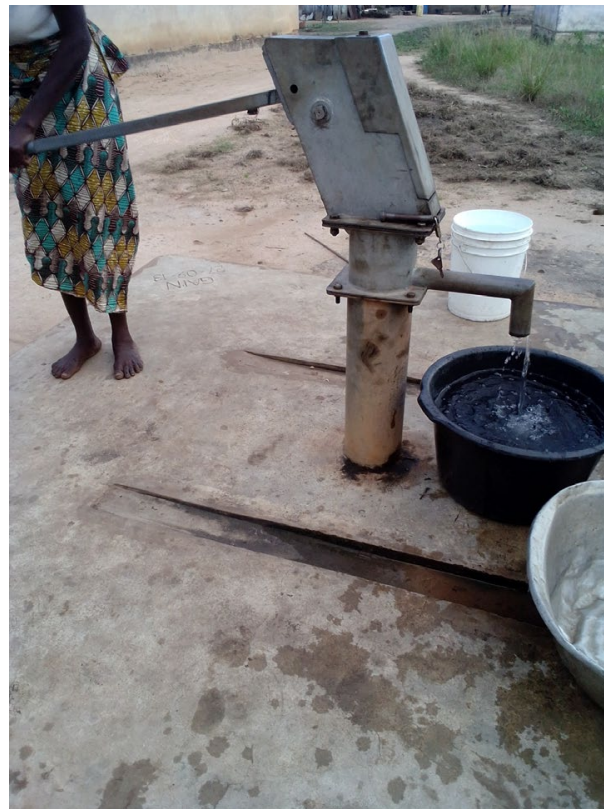
Figure 2. Lomegnonkopé fountain bollard (Field photo, CEESPOD, December 2022).

Note: * National company providing access to drinking water in Togo.