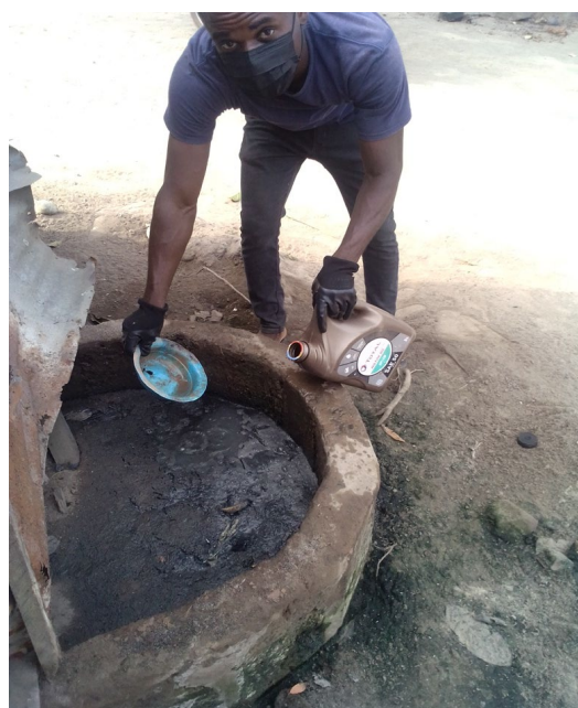
Figure 8. Wastewater sampling at Adétikopé (field photo, CEESPOD, December 2022).

Of the respondents, 58.22% knew about waste management, and 62.33% about waste recovery. However, 41.78% said they had no knowledge of waste management, and 36.30% had never heard of waste recovery. The majority of respondents (56.22%) had heard about waste management via the media (radio), and 2% had heard about it in the street. A 96.58% share of respondents knew wastewater poses a health risk, while 2.74% did not know that wastewater poses a health risk. The data collected in Table 8 relate to the treatment of water after use. These data are specific in that they concern the recovery of wastewater.