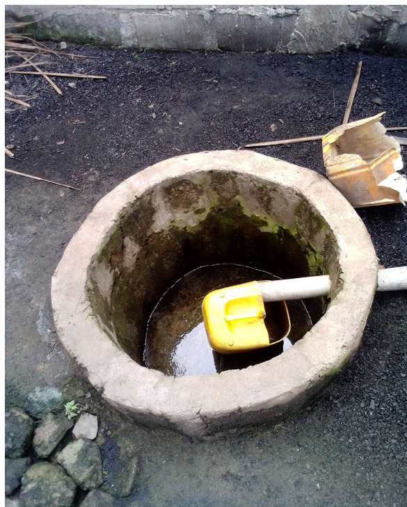
Figure 7. Wastewater reservoir in the center of Adétikopé (field photo, CEESPOD, December 2022).