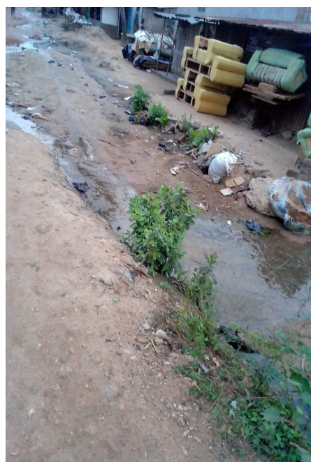
Figure 5. Wastewater on the road to Adétikopé-Centre town hall (field photo, CEESPOD, December 2022).