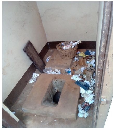
Figure 4. Sanitary facilities in a house in Tonoukoutsí (field photo, CEESPOD, December 2022).