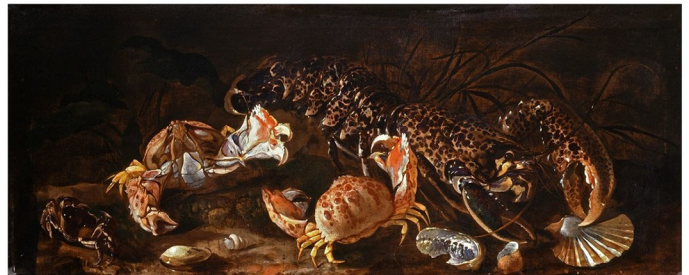
Fig 1. Selected paintings. P1: Giuseppe Recco—Naples (Italy) 1634—Alicante (Spain) 1695, Pisces , 1683. Private collection. Public domain CC0. Source: Commons.wikimedia.org. P2: Antonio Viladomat—Barcelona (Spain) 1678—Barcelona (Spain) 1755, Still Life with Shellfish, Fish and Vessels , 1710–1740. Prado National Museum. Public domain CC0. Source: Commons.wikimedia.org. P3: Vincenzo Campi—Cremona (Italy) 1536—Cremona (Italy) 1591, The fishmongers , 1579. Museum of La Roche-sur-Yon. Public domain CC0. Source: Commons.wikimedia.org. P4: Paolo Porpora—Naples (Italy) 1617—Rome (Italy) 1673, Still life of fish and crustaceans . Public domain CC0. Source: Commons.wikimedia.org.

https://doi.org/10.1371/journal.pone.0303584.g001