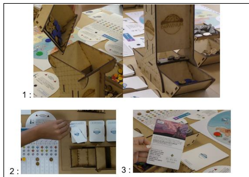
Figure 1. Overview of parts of the Darwinium board-game. (1.1 token thrown in the dice tower (left) and selected (right), 1.2 “Trait” card drawn, 1.3 “Event” card drawn)