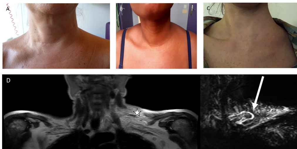
Fig. 1. (a–c) Patients with recurrent swelling syndrome during an attack. (d) Thoracic lymph-node magnetic resonance imaging (T2): left supraclavicular edema (star) and dilated aspect of the thoracic duct endings (arrow).

In conclusion, we propose three diagnostic criteria for the diagnosis of RCSS: