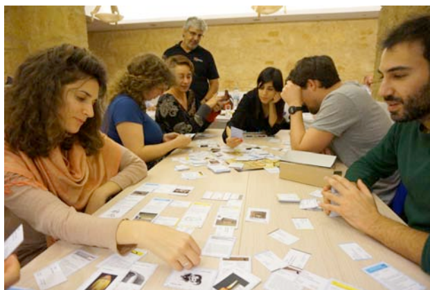
Figure 5. Teams playing the CIDOC CRM Game in a workshop

This scenario provided instance cards that would represent potential data units within individual data structures that would need to be translated into CIDOC CRM form. We relied on the players' intimate knowledge of the case study as the background information from which to draw upon in order to put together the data through meaningful relations. In playing the game, the players have in mind to create data structures relevant to their area of research and progressively see how this data could be connected to the research of others.