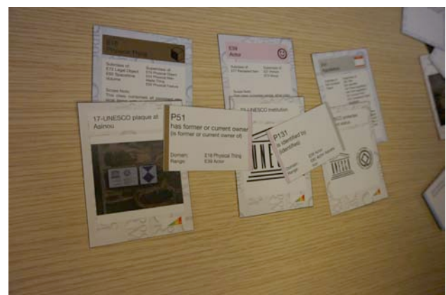
Figure 6. Example of Instance Cards mapped with CRM Cards

Running the game experiment in practice proved a learning opportunity both for the target audience and for the game designers in understanding what did and did not work in the game design and the extent of its utility in communicating the ideas and skills relevant to understanding formal ontology and CIDOC CRM. During the running of the game workshops which were held, we observed the players in action, trying to understand what parts of the game facilitated or did not facilitate the appropriation of formal ontology concepts. Furthermore, a questionnaire was distributed at the end of each session seeking feedback on the game from the learner's perspective.