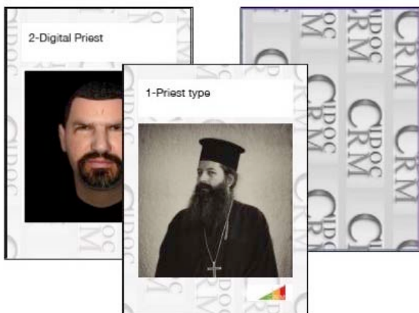
Figure 3. Instance Cards

In the initial version of the game, the instance cards displayed data units related to the Initial Training Network-Digital Cultural Heritage ( http://www.itn-dch.eu/ ) study of the Byzantine church Asinou located in the Troodos mountains of Cyprus. This scenario was selected because of its immediate relevance to the interdisciplinary group of researchers involved in that project, who were the test subjects of the game scenario. The case-study of Asinou was well known to the participants each from their respective disciplinary perspective.