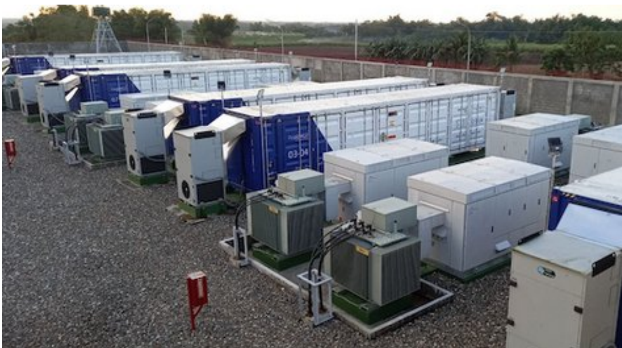
Figure 1: Fluence's 20MW/20MW Kabankalan project, Negros Occidental, Philippines. Image: Philippines .