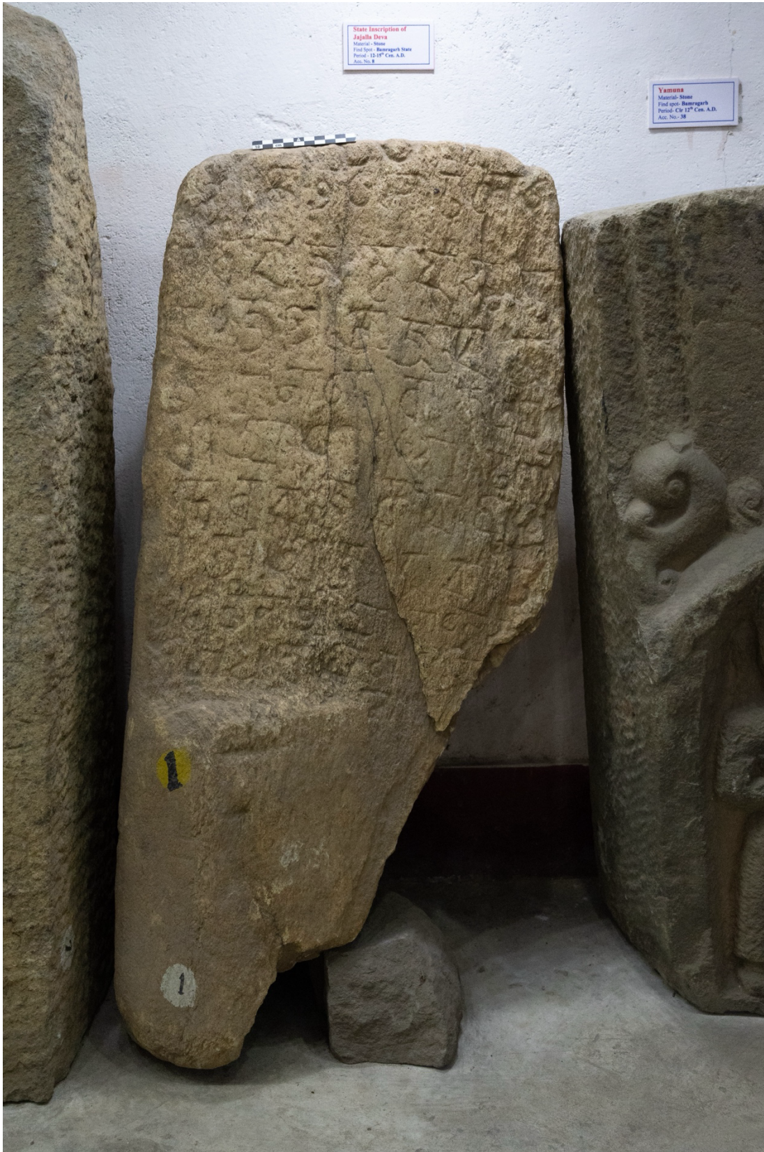
Figure 19. State Inscription of Jājalladeva (?).

Link to the photos: https://didomena.ehess.fr/concern/data_sets/0z709564s