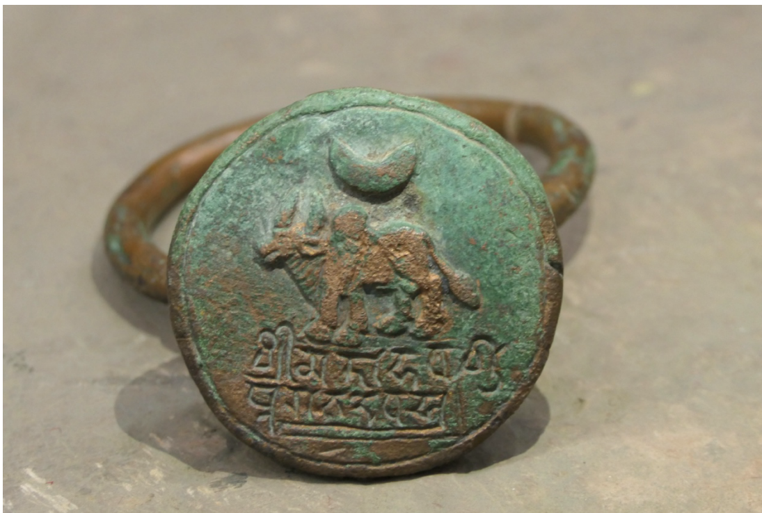
Figure 4. Seal of the Ruchida plates of Mahābhavagupta, year 8.

Link to the photos: https://didomena.ehess.fr/concern/data_sets/x920g5138