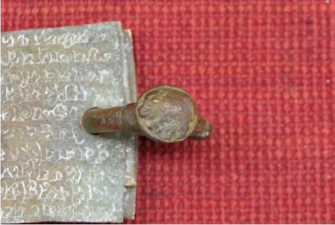
Figure 3. Seal attached on the Baragaon plates of the time of Janamejaya, year 13.

Link to the photos: https://didomena.ehess.fr/concern/data_sets/kp78gq996