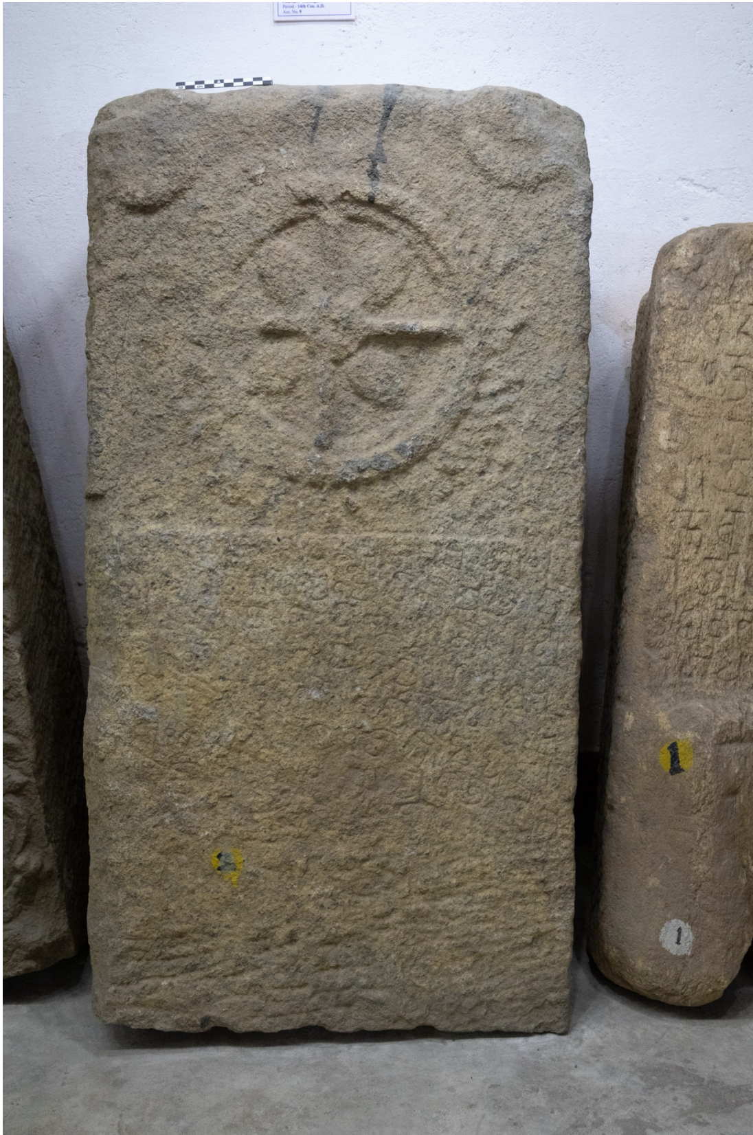
Figure 18. Stone inscription of Rāmadeva, first Chauhan rāja of Patna state.