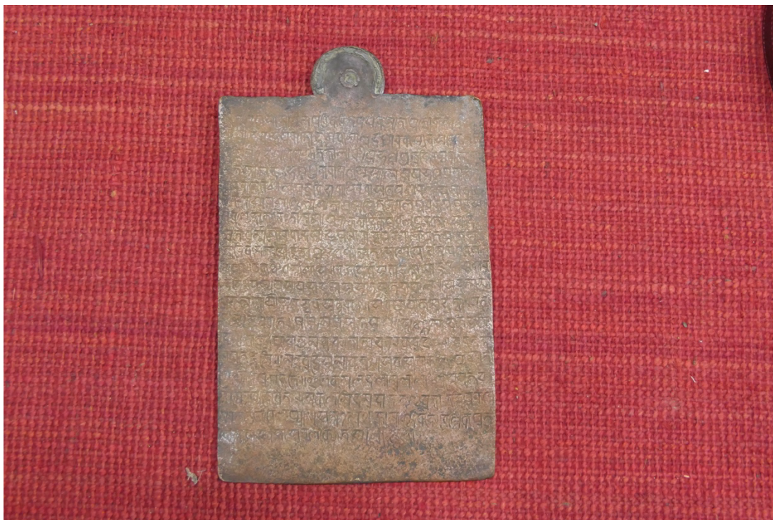
Figure 6. Verso of the plate of Vinītatūṅga.

Link to the photos: https://didomena.ehess.fr/concern/data_sets/5x21tq64d