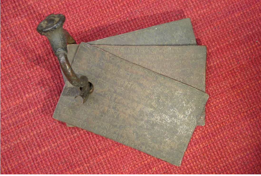
Figure 5. Gañjam plates of Śatrubhañja Tribhuvanakalaśa, year 198.

Link to the photos: https://didomena.ehess.fr/concern/data_sets/vt150s87x