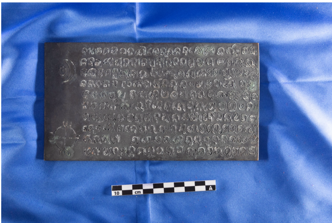
Figure 16. Copper plate grant of Prithvi Sing, Mahārāja of Sonapur.

Link to the photos: https://didomena.ehess.fr/concern/data_sets/3t946079f