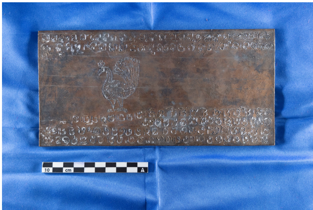
Figure 14. Unidentified copper plate with a peacock.

Link to the photos: https://didomena.ehess.fr/concern/data_sets/hx11xp98s