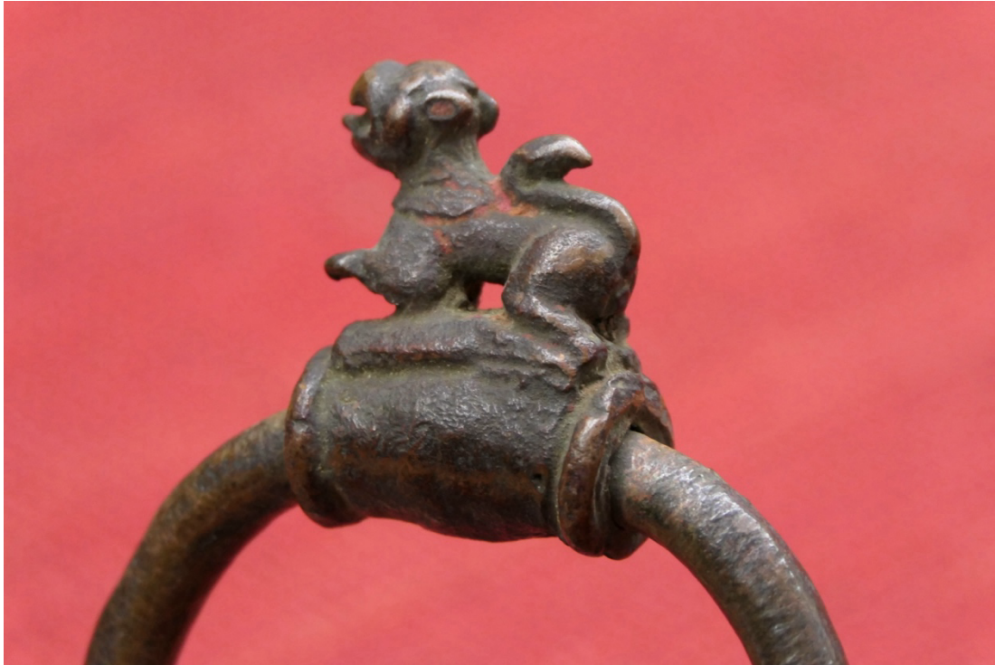
Figure 12. Lion seal attached to the copperplate set probably of Someśvaradeva.