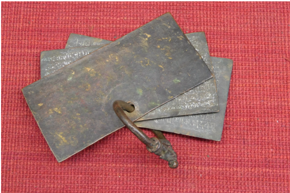
Figure 13. Copperplate set probably of Someśvaradeva.

Link to the photos: https://didomena.ehess.fr/concern/data_sets/2227mz41h