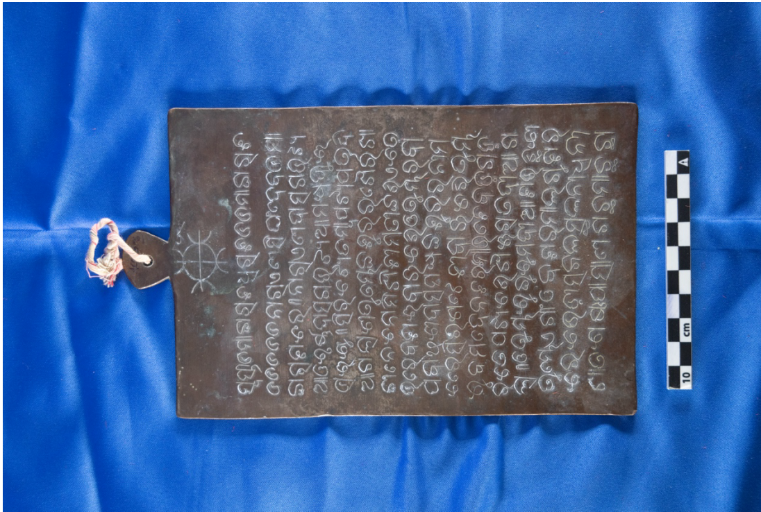
Figure 15. Sirkata copper plate grant of Mahārāja Narayan Singh of Sambalpur.

Link to the photos: https://didomena.ehess.fr/concern/data_sets/bn999g653