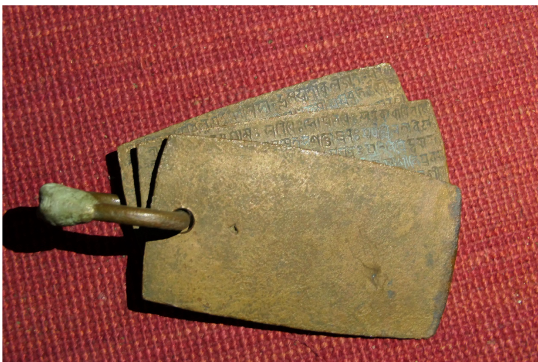
Figure 2. Sambalpur University Museum plates of the time of Janamejaya, year 23.

Link to the photos: https://didomena.ehess.fr/concern/data_sets/gt54kw69