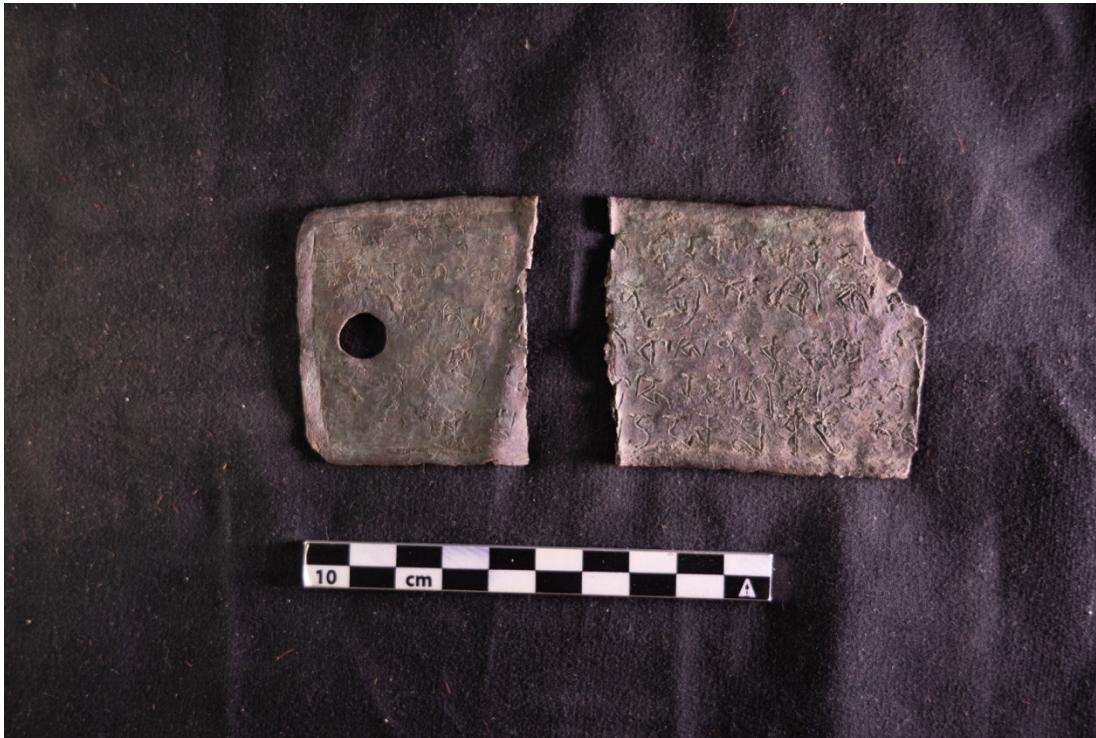
Figure 7. Two fragmentary pieces of a plate from Narla.