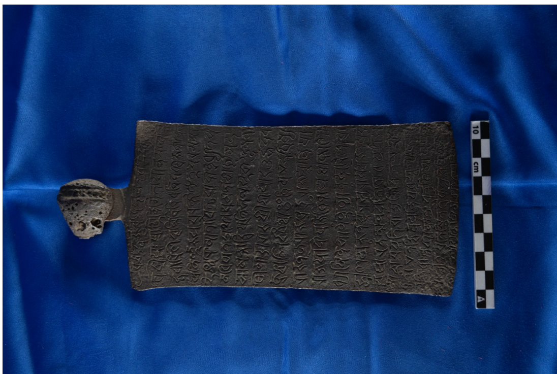
Figure 10. Talcher copper plate charter of Gayādatuṅga.

- Acharya, Subrata Kumar. 2014. Copper-Plate Inscriptions of Odisha: A Descriptive Catalogue (circa Fourth Century to Sixteenth Century CE) . New Delhi: D. K. Printworld, n°3, pp. 388-389.