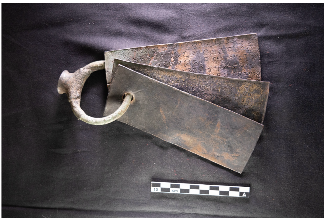
Figure 11. A copper plate charter of Śrīmadmahārājabhañja.

Link to the photos: https://didomena.ehess.fr/concern/data_sets/2514nv332