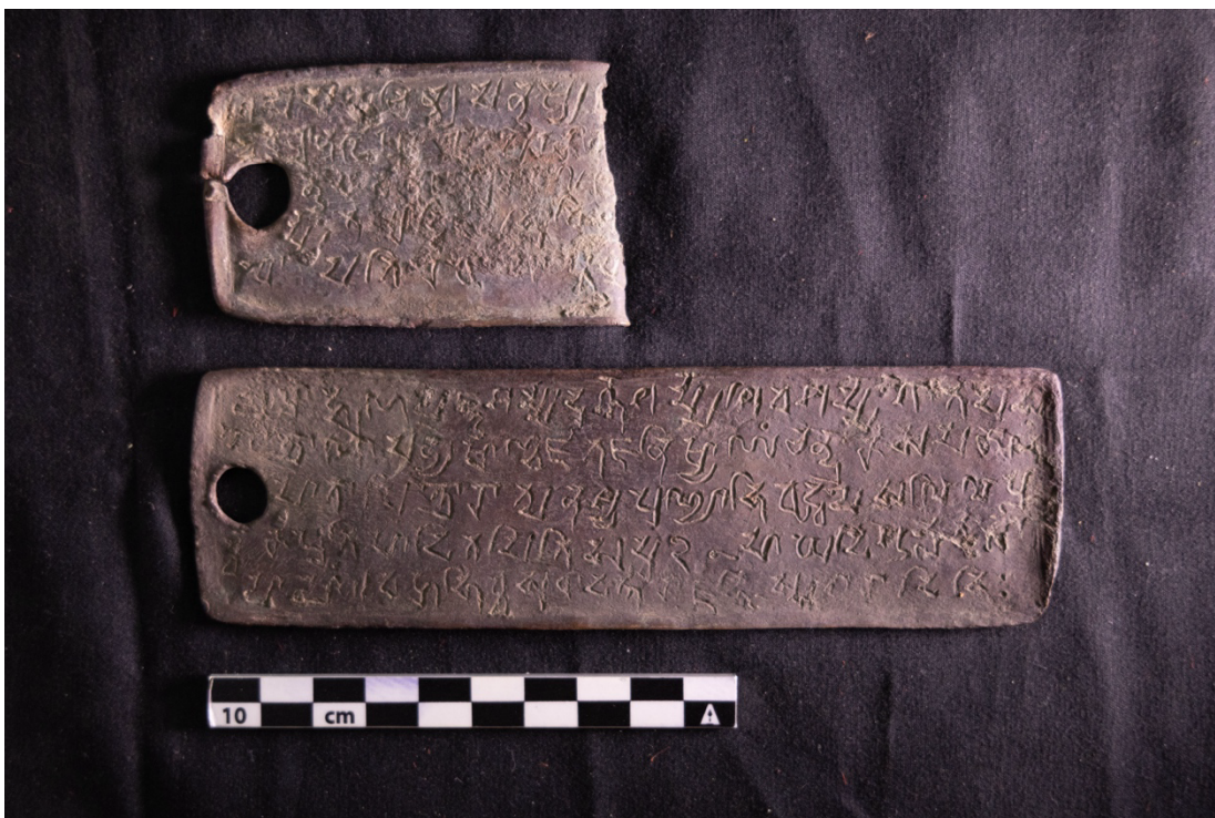
Figure 8. Fragmentary plate and single plate from Narla.

Link to the photos: https://didomena.ehess.fr/concern/data_sets/t722hj248