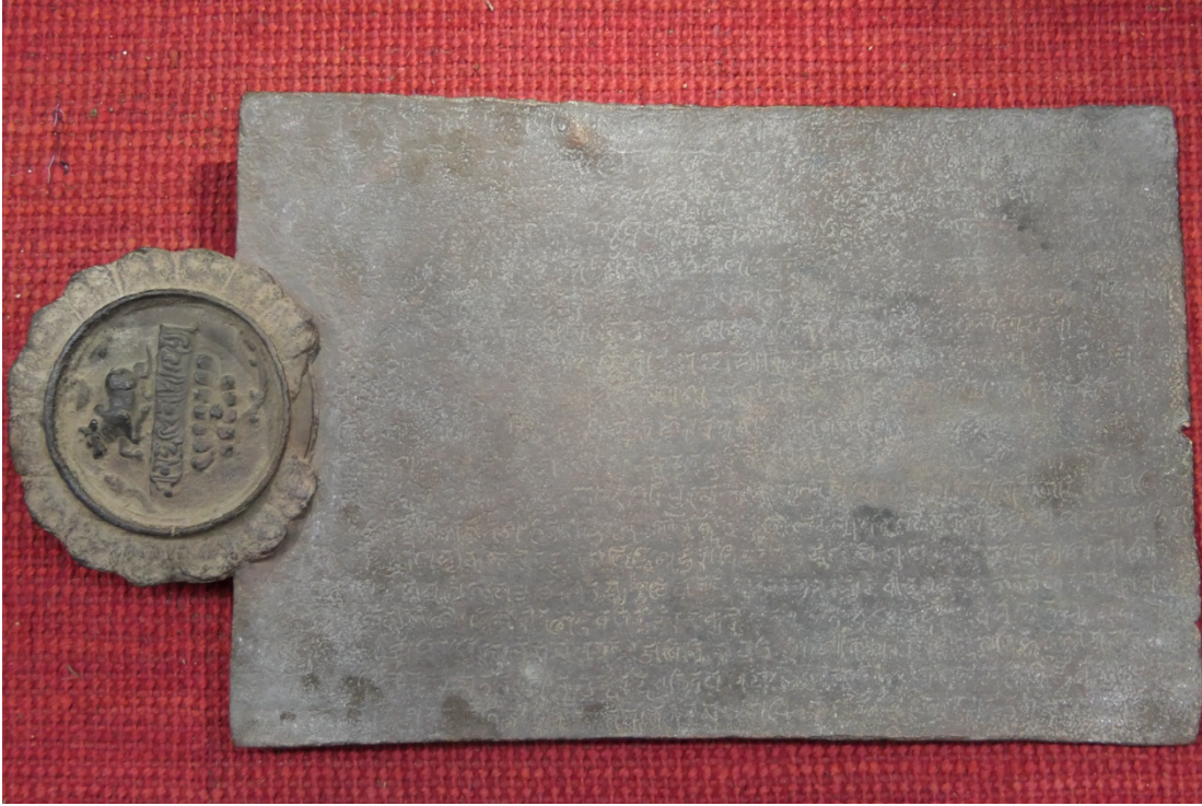
Figure 1. Ambapua grant of Daṇḍīmahādevī.

Link to the photos: https://didomena.ehess.fr/concern/data_sets/rb68xm63t