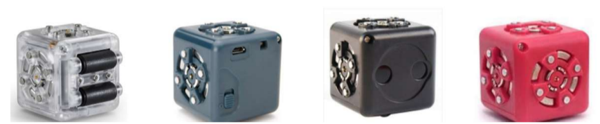
Figure 1. Four Modular Cubelets Offered to Solve Ill-Defined Creative Problem

Video recordings, observational notes, and coding systems intended to measure problem-solving metrics were all used in the data collection process.