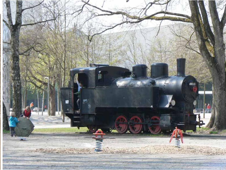
Heritage elements accessible to kids

evolution. They can also help to open up the kids' minds to cultural or natural heritage values that they would not have thought of. We also recommend that the exercises be carried out on sites that are familiar to the children, the historic centre of their town or village, the nearby countryside with its old houses, rather than taking them far away to visit a castle or a cathedral.