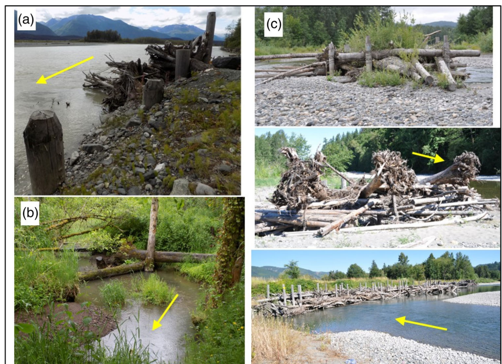
FIGURE 1 Examples of engineered logjams. Arrows indicate flow direction. (a) Tsirku River, Canada. (b) Tryon Creek, Oregon. (c) All three photos from South Fork Nooksack River, Washington. [Color figure can be viewed at wileyonlinelibrary.com ]

The workshop focused on practitioner perspectives of wood dynamics in natural and managed systems and how those impact upon management practices. Primary objectives were to identify (i) the key challenges and concerns that may limit the use of large wood in river