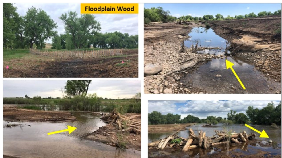
FIGURE 3 Examples of wood structures emplaced in the floodplain and channel. Yellow arrows indicate flow direction. [Color figure can be viewed at wileyonlinelibrary.com ]

The sustainable use of wood in rivers as a management technique requires an inherently interdisciplinary approach, with a need to consider knowledge from geomorphology, sedimentology, riparian and stream ecology, and civil and environmental engineering. Working with a wide range of people can increase the diversity of knowledge brought to management, and it is important to increase the diversity of people participating in river management. This includes the need to cross traditional disciplinary silos as well as between the researcher and practitioner communities. This was reflected in the online survey of researchers and practitioners, all of whom currently collaborate within and beyond their own discipline (Figure 5a and Supplemental Information tables). When participants were asked who they would like to work with in the future, the number and scope of potential