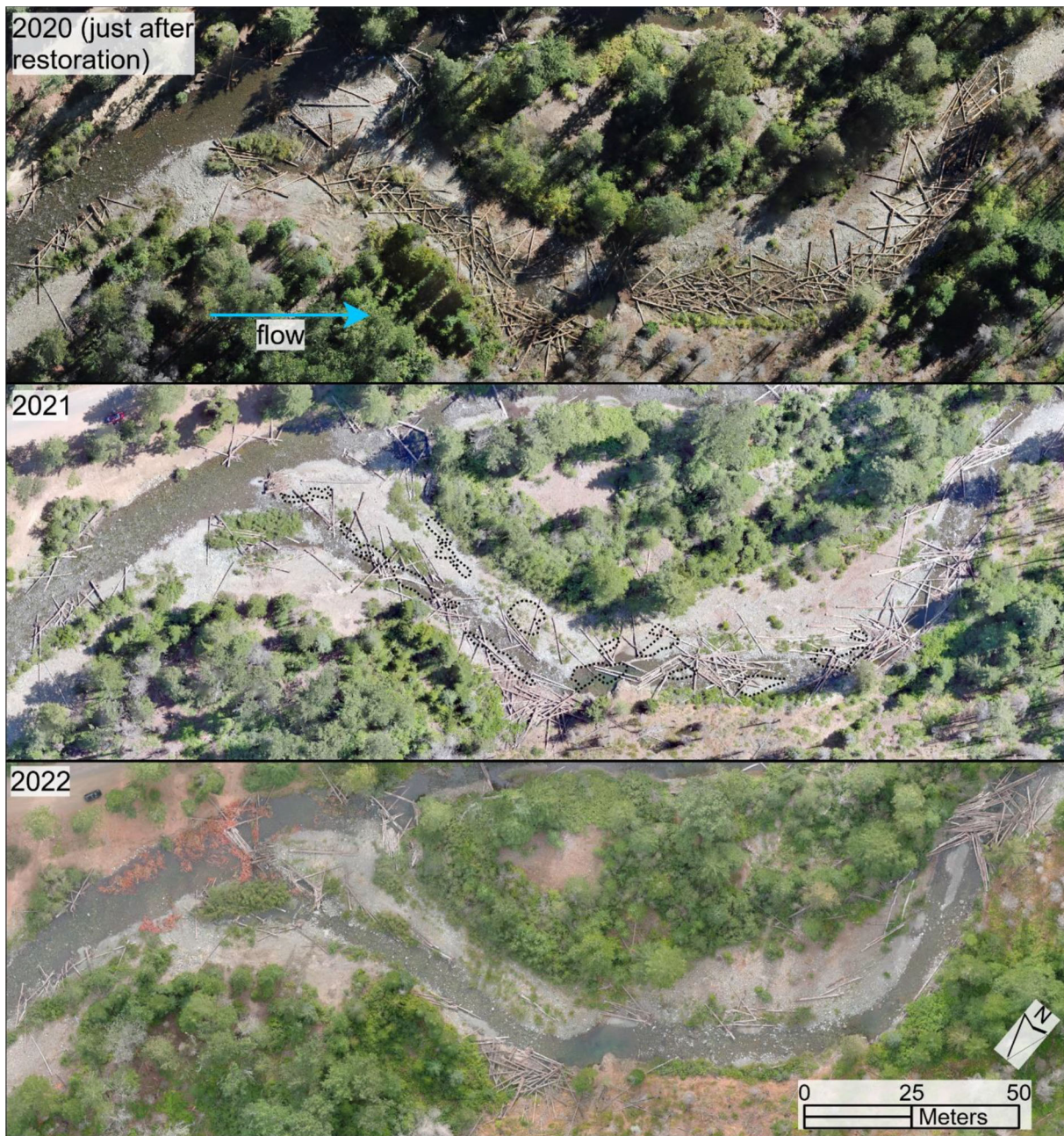
FIGURE 2 Repeat, orthorectified, georeferenced aerial photo mosaics showing the post-restoration wood assemblage along the North Fork Teanaway and its evolution over 2 years. Dotted black lines outline where fine sediment aggraded during 2020–2021. [Color figure can be viewed at wileyonlinelibrary.com ]