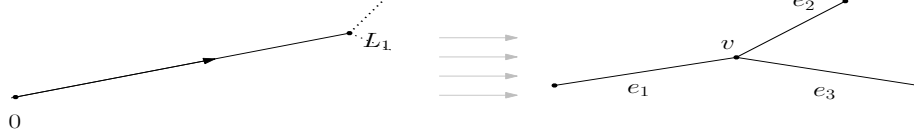
Figure 1: The figure shows the parametrization of a star-graph with 3 edges.

connecting all the edges of \mathcal{S} and we parameterize each e_j with a coordinate going from 0 to its length L_j in v .