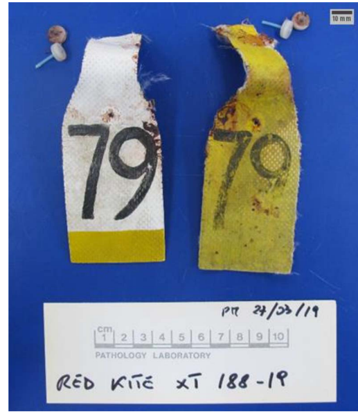
FIGURE 2. Patagial wing tags removed from left wing (white) and right wing (yellow) of a Red Kite ( Milvus milvus ) designated Red Kite 1, found in Deene, Northamptonshire, UK, September 2018.

Red Kite 1, which had been tagged as a fledgling in 2004, was found dead on a footpath on 31 August 2018 in Deene, Northamptonshire, received at IoZ on 11 September 2018, and immediately frozen at -20^{\circ}\text{C} until examination on 13 September 2018. This adult female was carrying a patagial tag on each wing (Fig. 2). The carcass weighed 918.6 g (adult female range 800–1,300 g; Snow et al. 1998) and was deemed