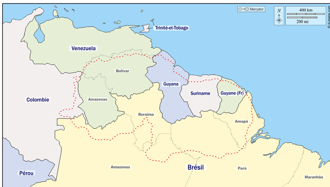
Fig. 1 Map of the Guiana Shield, limited by the spotted dots

reported in a US traveler returning from Venezuela (1999) and one autochthonous case in Bolívar state of Venezuela (2019); one case reported in a Dutch traveler returning from Suriname (2017); and one autochthonous case in Amapá (2021). All cases are summarized in Table 1 and detailed in Supplementary Data 1.