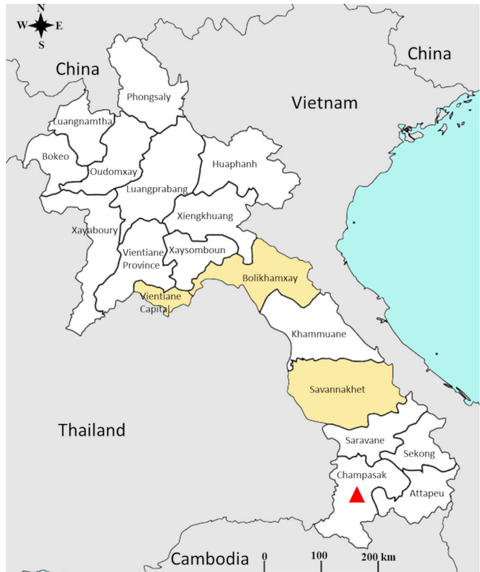
Fig 1. Geographical location of chikungunya cases, at the province level, in Lao PDR. Data based on the analysis of the samples collected by the Institut Pasteur du Laos arbovirus surveillance network between 2012 and 2020. The provinces indicated in yellow correspond to those where at least one sample was found positive for chikungunya virus during the study period (2014–2020). The red triangle indicates the province where the chikungunya outbreak occurred in 2012–2013.

https://doi.org/10.1371/journal.pone.0271439.g001