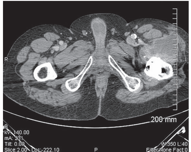
Figure 1. Computed tomography scan of pelvis in case 1 showing large abscess of the left hip with a periosteal image compatible with an osteitis in case of Francisella tularensis –related prosthetic joint infection, France

Serologic samples from early September 2018 showed elevated IgM titers of 3.58 (reference <0.45) and IgG titers of 1.5 (reference <0.62) by ELISA (Serion Diagnostics) and titers of 640 (IgM) and 640 (IgG) by IFA, corroborating recent F. tularensis infection. Antibiotic therapy with ofloxacin (200 mg 2×/d) was administered for 6 weeks, and a 1-stage joint